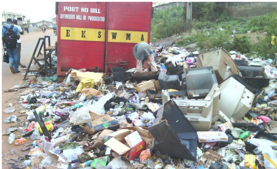
Plate 1: Refuse dumped at the base of a waste container and along the street at Ijigbo Junction, Ado Ekiti.