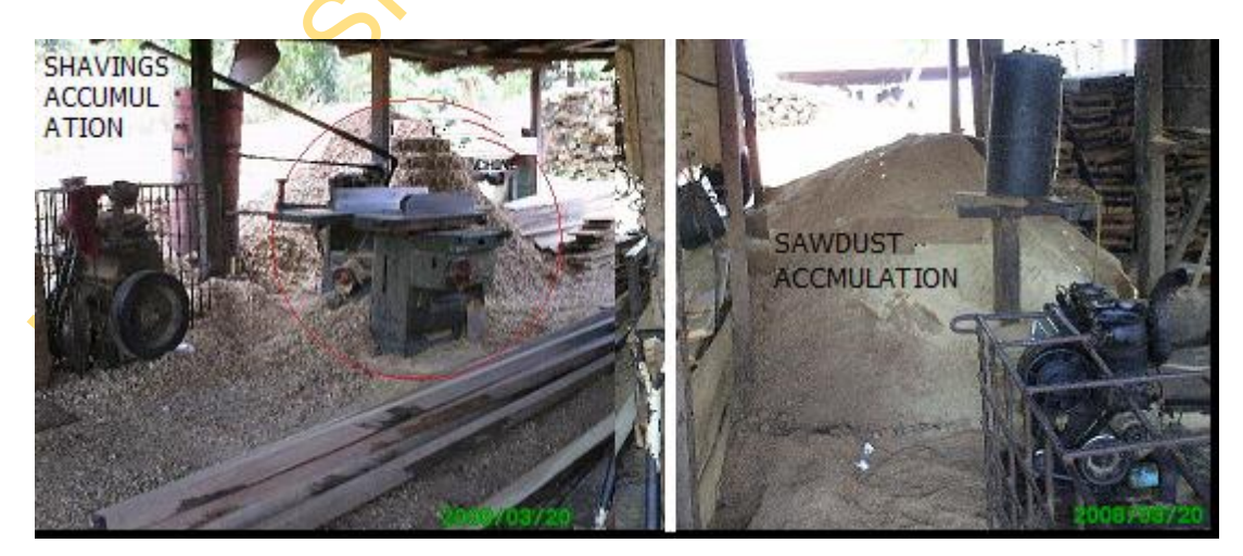
Figure 2: Waste accumulation around the mill

Accident investigations and documentation are essentially non-existent as evident by the nonavailability of accident/injury records in nearly all the sites visited. Organization of effective training for workers—particularly young and newly employed should be regularly done to minimize human danger. Non-availability and in many cases disregard to the use of individual protection devices and other safety materials caused was largely responsible for the high rate of musculoskeletal and respiratory infections in the industry.