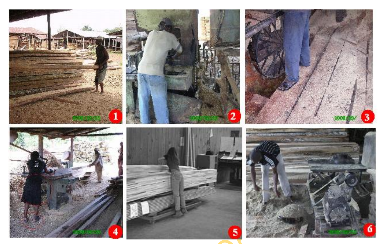
Figure 1: Identifiable hazards in sawmill sites: 1) Manual Lifting and stacking sawn lumber, 2& 3) Non-use of protective wears and equipment during maintenance, 4 & 5) Repetitive motion, twisting and reaching for objects and 6) Breathing in of noxious or toxic chemical emissions during waste disposal with head pan

Accident investigations and documentation are essentially non-existent as evident by the nonavailability of accident/injury records in nearly all the sites visited. Organization of effective training for workers—particularly young and newly employed should be regularly done to minimize human danger. Non-availability and in many cases disregard to the use of individual protection devices and other safety materials caused was largely responsible for the high rate of musculoskeletal and respiratory infections in the industry.