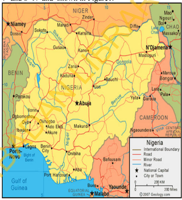
Figure 1. Map of Nigeria showing the location of Ibadan

The study area for this work is Ibadan and its environ which is located within the Southwestern part of the Nigeria between longitudes 3° and 4° E and latitudes 7° and 8° N and shown in Figure 1.