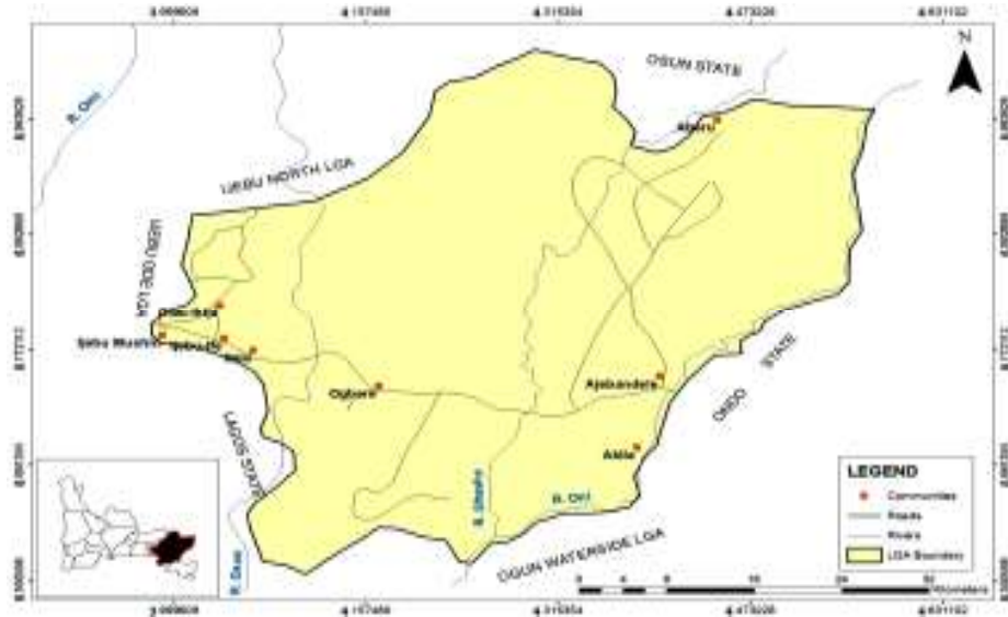
Figure 1: Map of Ijebu East Local Government area showing the sampled communities.