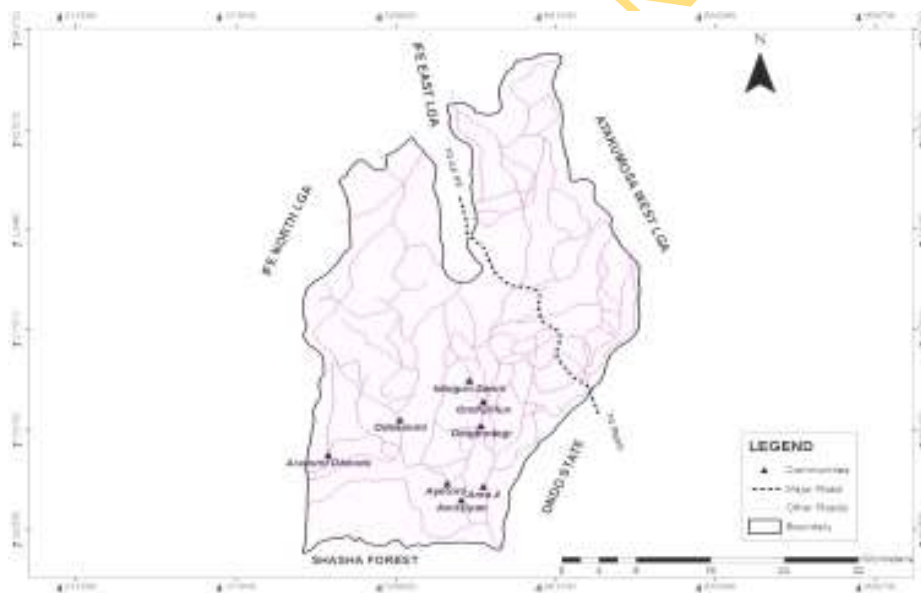
Figure 2: Map of Ife South Local Government Areas showing the sampled communities.