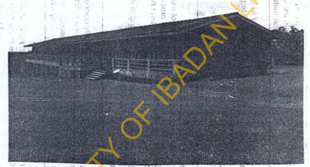
Plate 2: Stone walled building at Farm Institute, Ewele, Ogun State