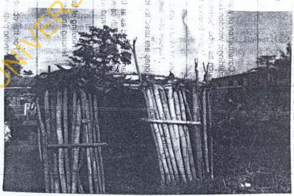
Plate 3: Bamboo shed with palm fronds as roofing material