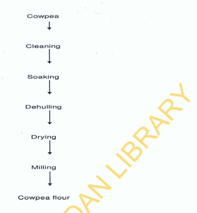
Figure 1. Flow diagram of cowpea flour preparation