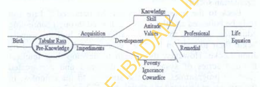
Fig. 1: Life equation with continuing education.

This admonition shows that the Yoruba culture believes that since life is a continuum education is also a continuum i.e. it continues even after death because one has to learn to eat what the heavenly bodies eat in heaven and not be tempted to eat the multitude of millipedes and earthworms that may surround him in his grave. Thus, life equation is balanced through continuous learning and knowledge acquisition. Figure 1 aptly captures the key variables of this fecture: