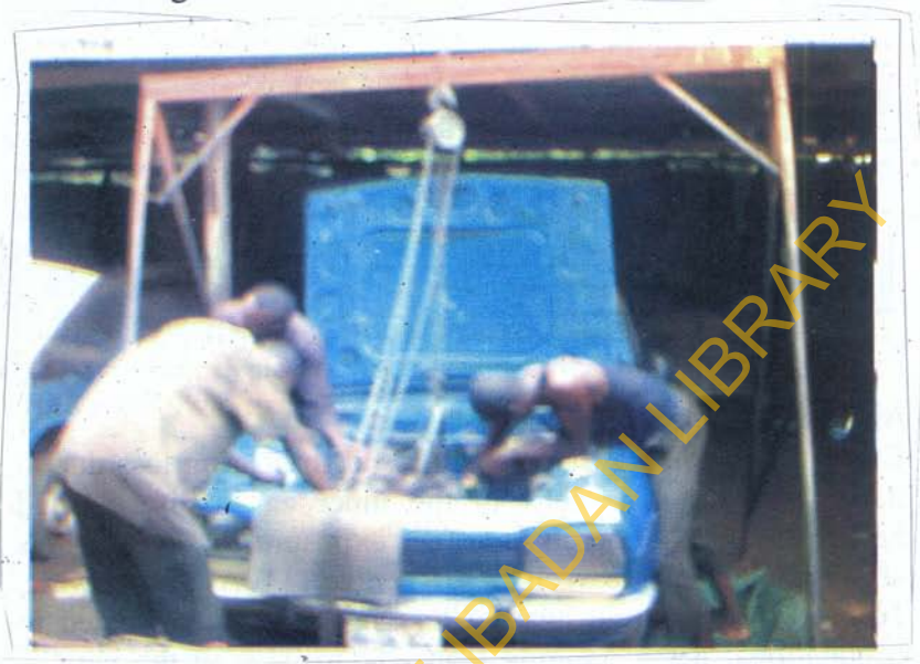
Fig. 5: Work postures predisposing to low back pain among mechanics.

abound in all these trades due to the manual nature of their work and awkward postures maintained at work such as shown in figure 5.