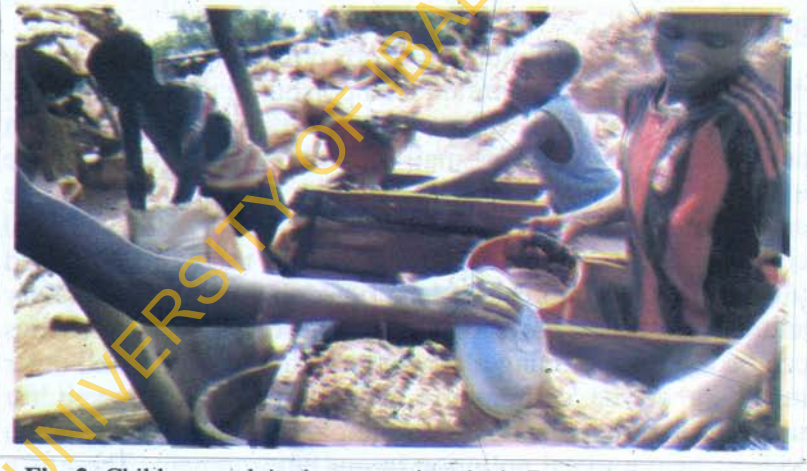
Fig. 2: Children work in the processing site in Bagega, Zamfara State.