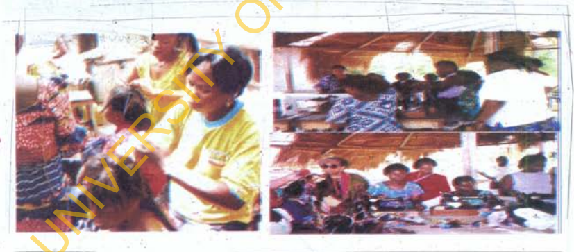
Fig. 4: Workers in the informal sector.

Exposure to these workplace hazards lead to various work-related diseases among the artisan trades (fig. 4). I have conducted surveys among at least 9 of these trades and obtained reports of work-related illnesses (Omokhodion et al. 1996, 2005, 2009, 2013, 2016). The tables below, 3a and 3b show the common health problems reported by workers in artisan trades.