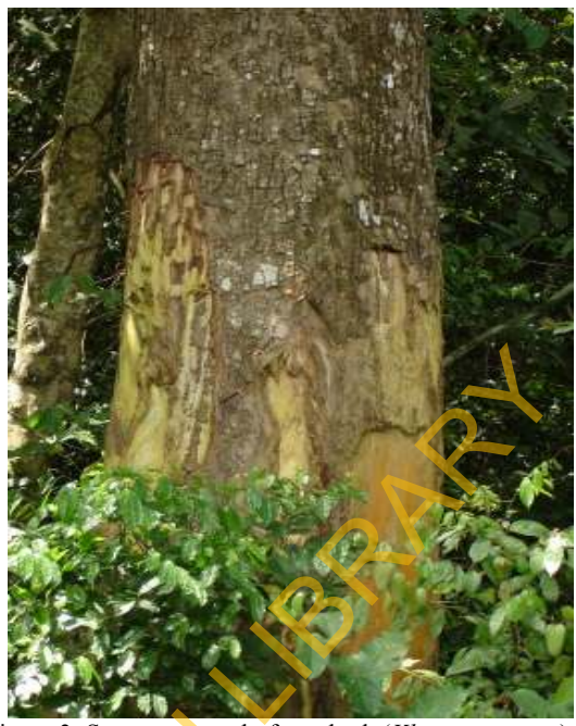
Figure 3: Severe removal of tree bark ( Khaya ivorensis ) can kill the tree through blockage of translocation of water and minerals salts

With the exception of Vitelaria paradoxa whose fruit maturity period extends from March to September, flowering of the species generally began from October to April, while fruit maturity also occurred from December to July (Table 3). Seed germination ability ranged from as low as 7% for V. paradoxa to as high as 74% for Khaya senegalensis . The duration of seed germination also varied considerably, ranging from 8 to 28 days for Tamarindus indica to 70-120 days for V. paradoxa (Table 3).