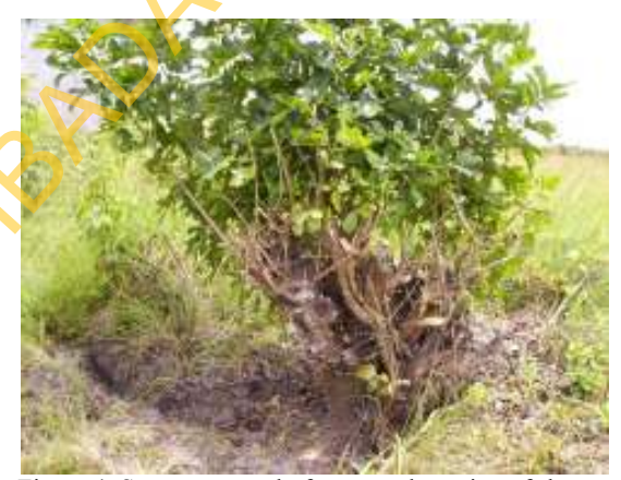
Figure 4: Severe removal of roots and pruning of shoots of Zanthoxylum zanthoxyloides . This harvesting method interferes with tree survival, flowering and fruiting and hence regeneration of the species.