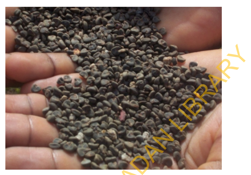
Figure 1. Seeds of H. sabdariffaba ready for planting.