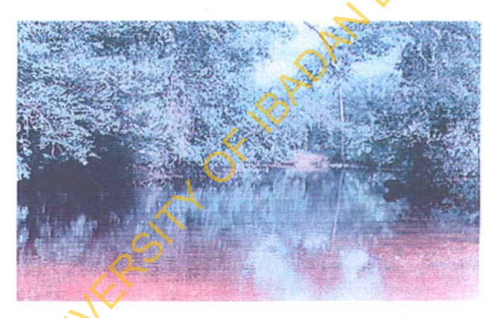
Plate 3: Characteristic mangrove vegetation along the coasts and creeks.

The dominant species in the mangrove vegetation include Rhizophora racemosa; Rhizophora mangle ; Alchornea spp ; Avicinia avicinia and Phonix reclinata (Plate 3).