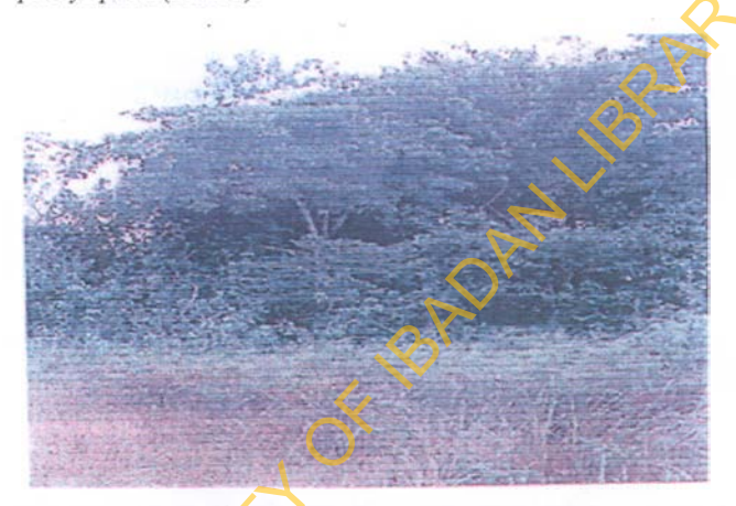
Plate 2: Relics of Lowland Rainforest at the boundary of the Sanctuary.

Elaeis guineensis and Mangifera indica at various points within the forest reserve. This vegetation exhibits the characteristic of maturing secondary forest with broken canopies and the presence of species such as Ceiba pentandra; Bombax spp.; Alchornea cordifolia; Senagilnalea spp.; Calamus spp.; Rauvolvia vomitoria; Herlia ciliata; and Tabernamontana pachysiphon (Plate 2).