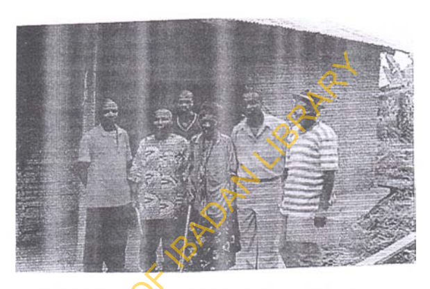
Plate 5: The chief of Mbo community with Forest Officers and Lifelink Consultant after a Focus Group Discussion.

project manager. The community had a population of about 500 indigenes as at 1992