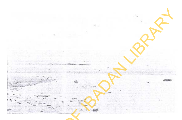
Plate 8: A sandy beach at the Mobil unlimited headquarters.

The presence of white sandy beaches (Plate 8) and in fact luxuriant natural vegetation in several places around the forest reserve is a great potential for ecotourism activities.