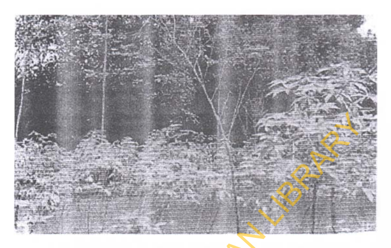
Plate 4: Cassava farm located in the conservation area at Ntak-Inyang.