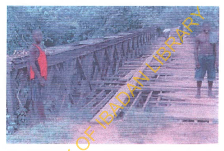
Plate 6: Dilapidated bridge linking the conservation area with Uyehe Community

Accessibility to the area via road is generally poor as most of the access roads are only seasonally motorable. Plate 6 shows a typical access bridge in the study area. In addition, communication facilities in the area are poor.