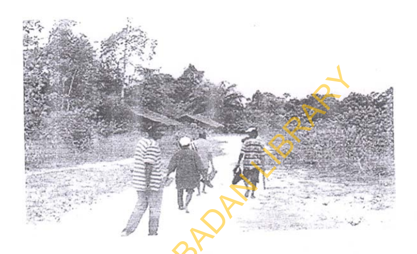
Plate 7: A settlement located within the sanctuary at Ntak- Iyang.