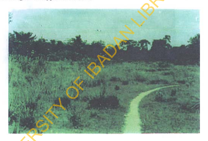
Plate 1: A farm Fallow Vegetation.

The vegetation of the forest reserve could be categorized into farm fallows (Plate 1), relics of the natural lowland rainforest, Raphia bush, Mangrove vegetation, Oil palm bush and relics of Gmelina plantation. The structure of the vegetation could be categorized on the basis of the various vegetation types as follows: