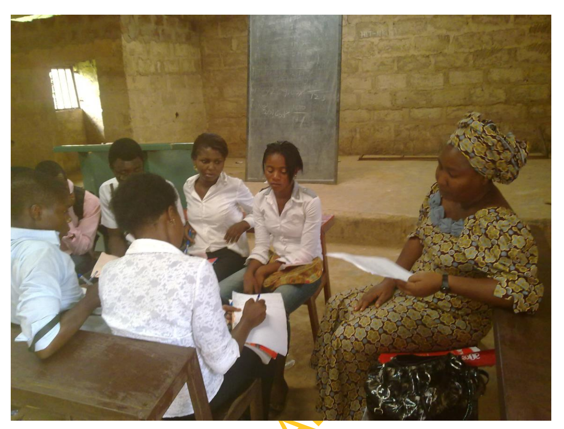
Plate 10: Focus Group Discussion Session