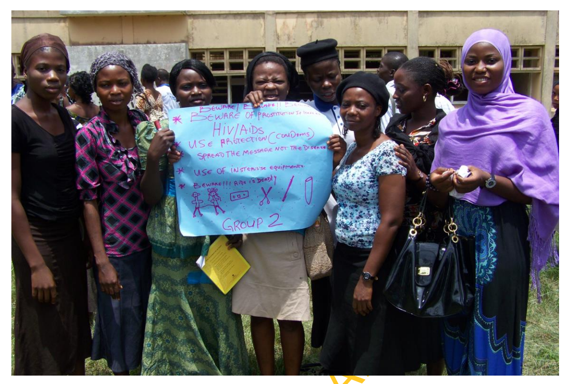
Plate 18: Poster presentation by a group on HIV/AIDS