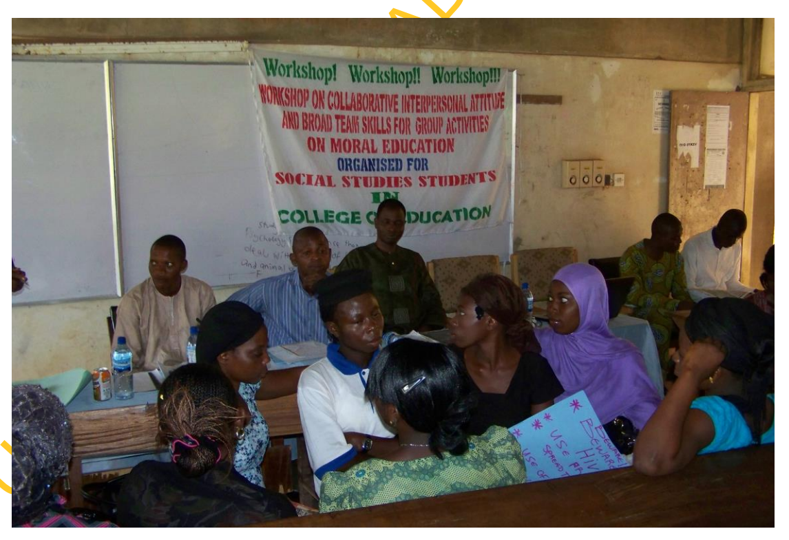
Plate 5: The Workshop