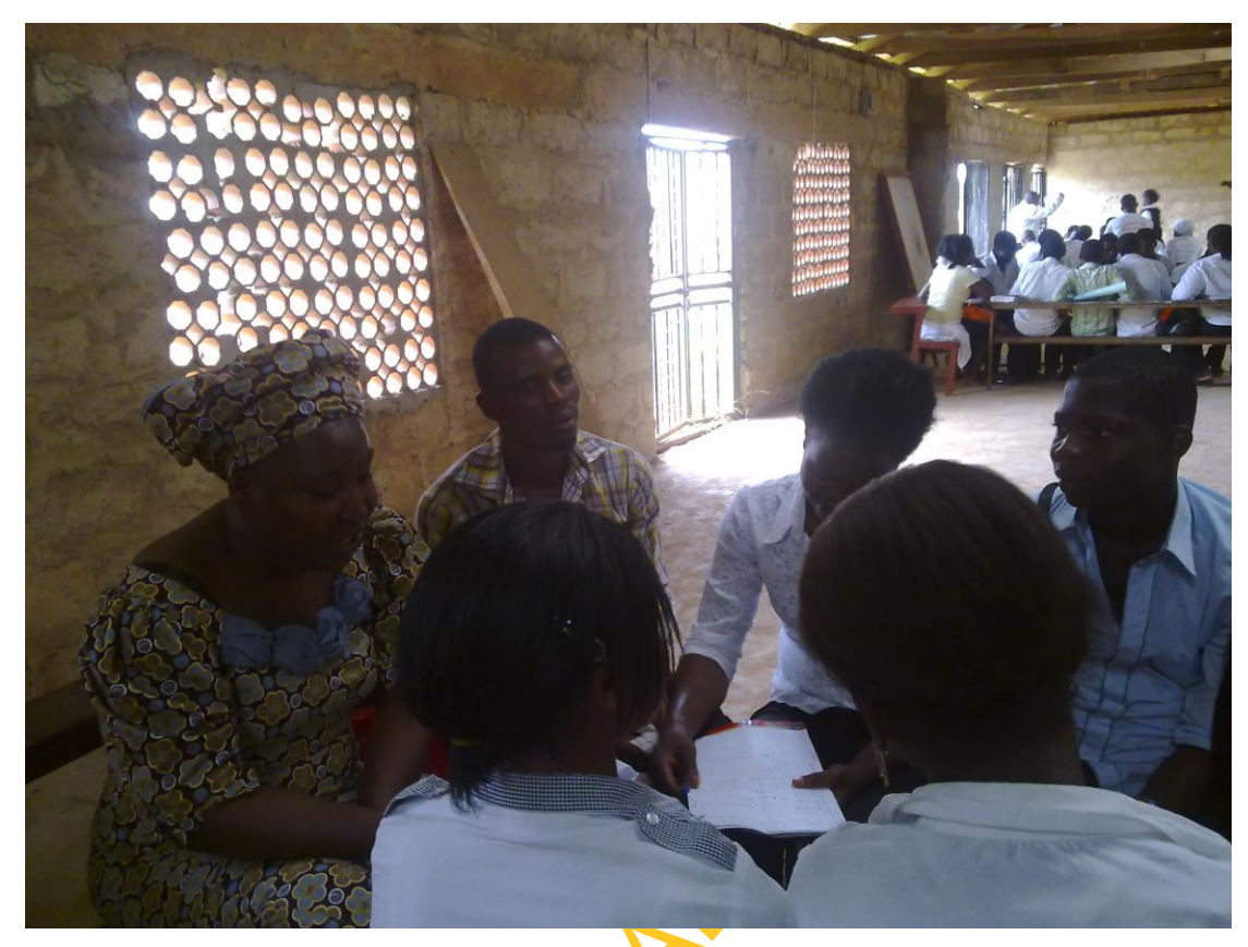
Plate 14: Focus Group Discussion Session 2