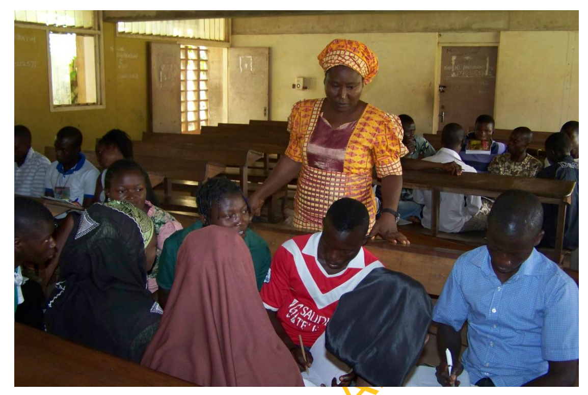
Plate 2: The researcher attending to a pre-test session