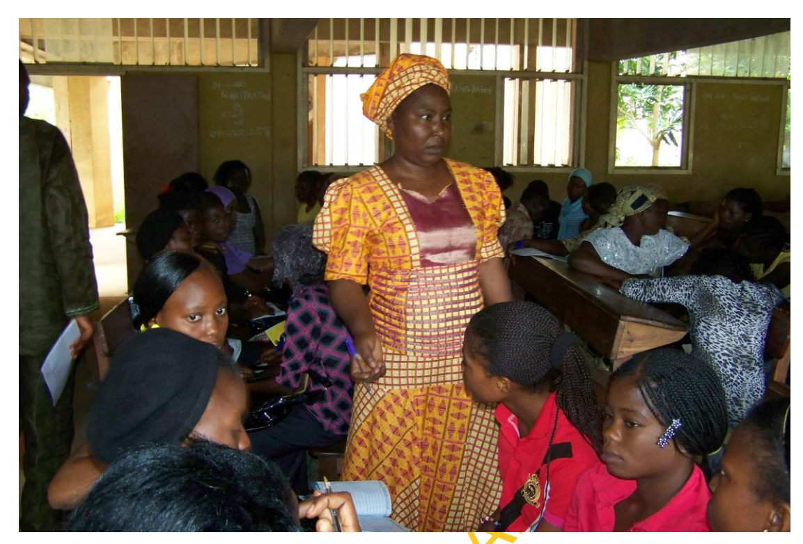
Plate 6: The workshop