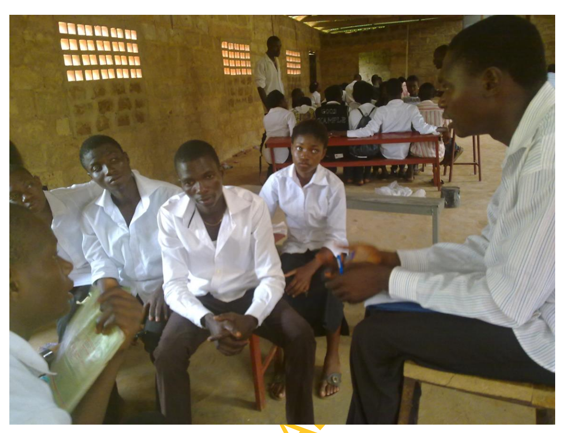
Plate 22: The executives of Moral Club holding a meeting