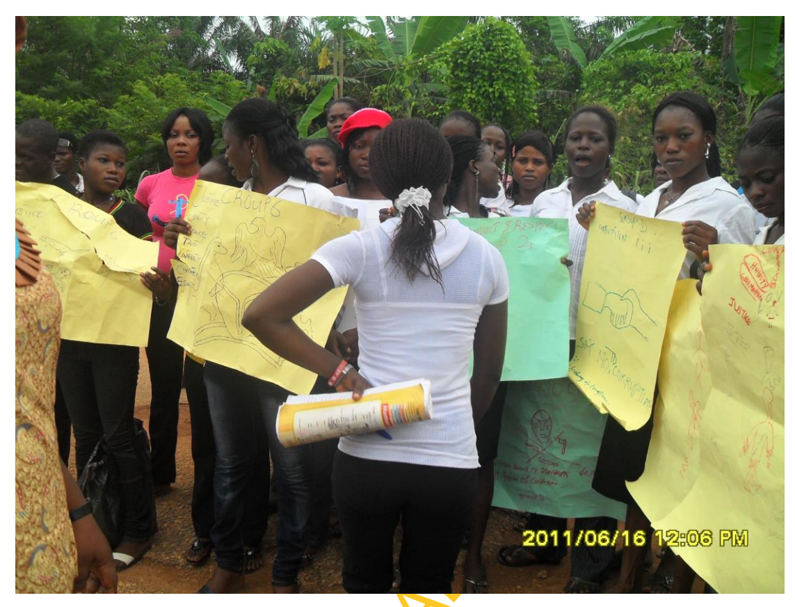
Plate 26: The Moral Club rally during community sensitization and mobilization