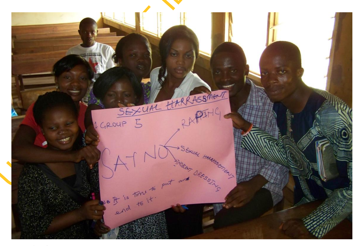
Plate 17: A poster presented by a group on sexual harassment