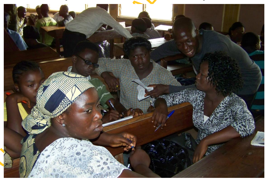
Plate 13: Focus Group Discussion Session 4