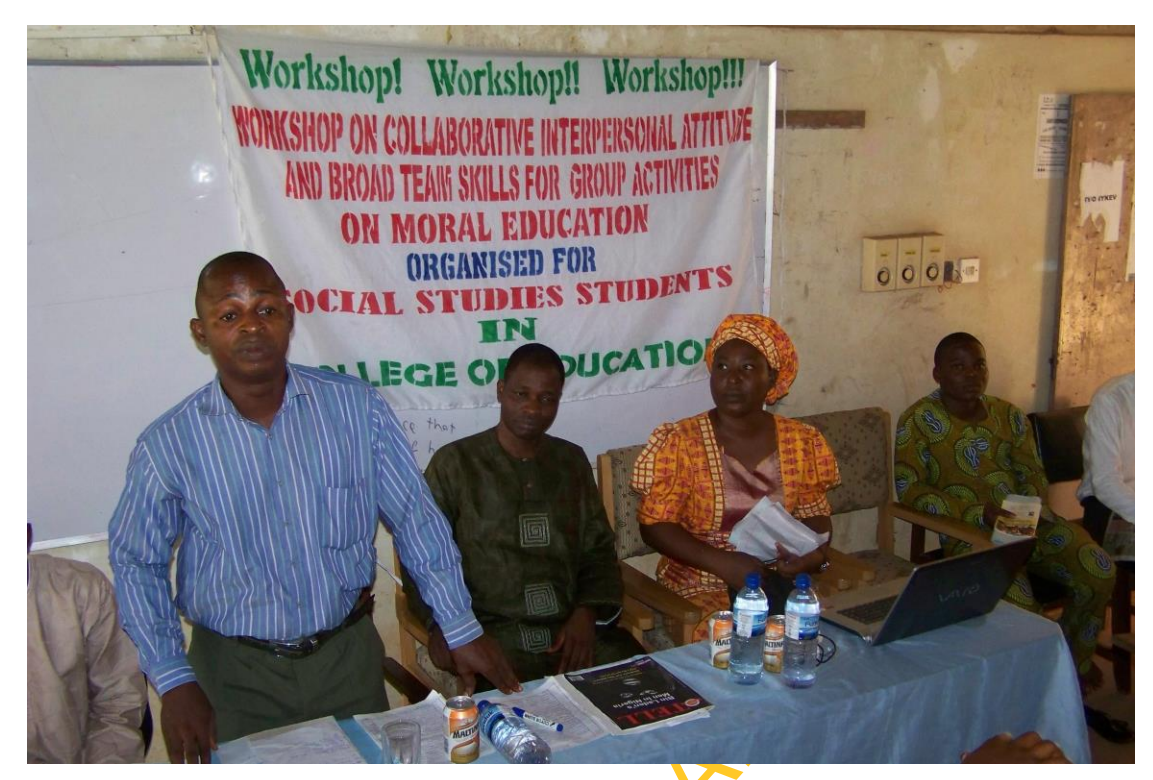
Plate 4: Workshop's opening session