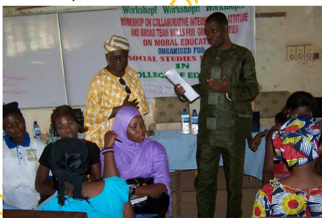
Plate 7: The resource person addressing Participants during the workshop