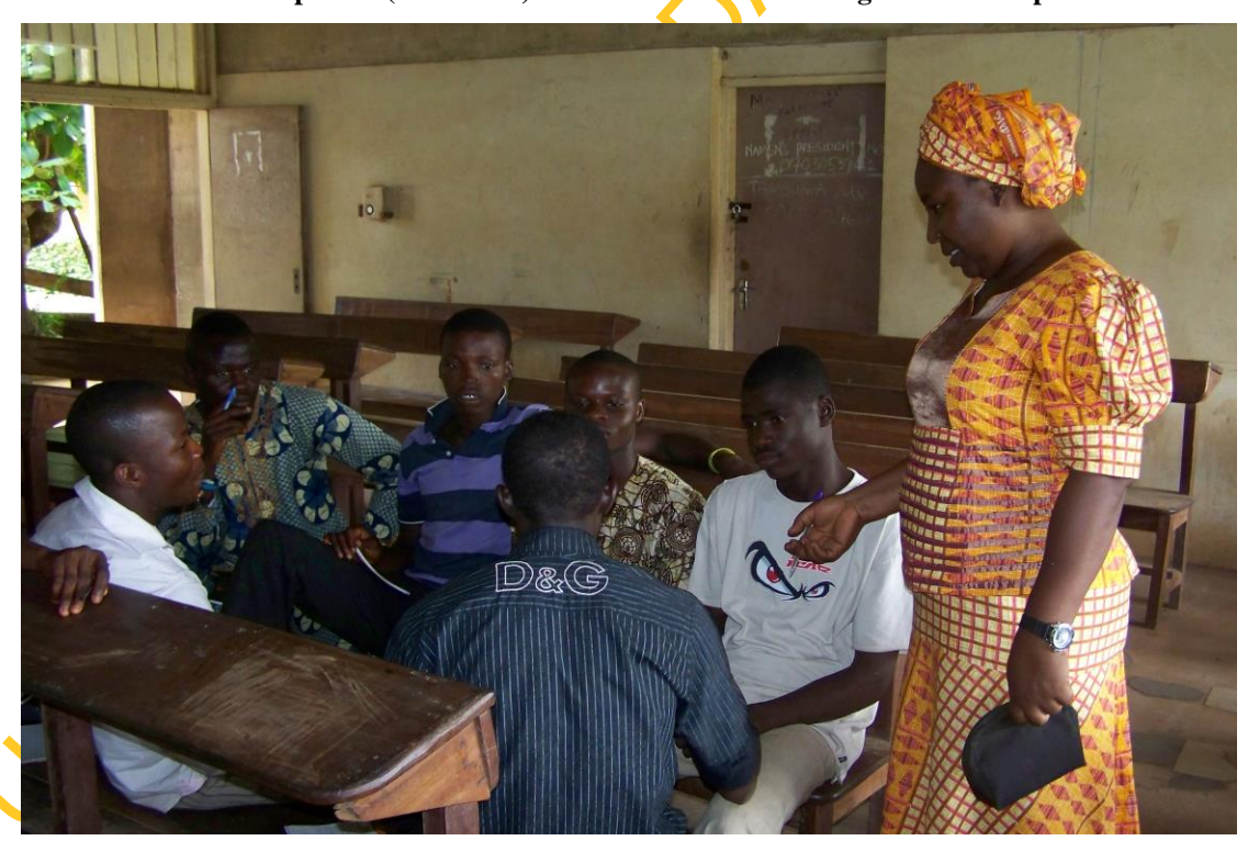
Plate 9: The researcher addressing one of the groups during the workshop