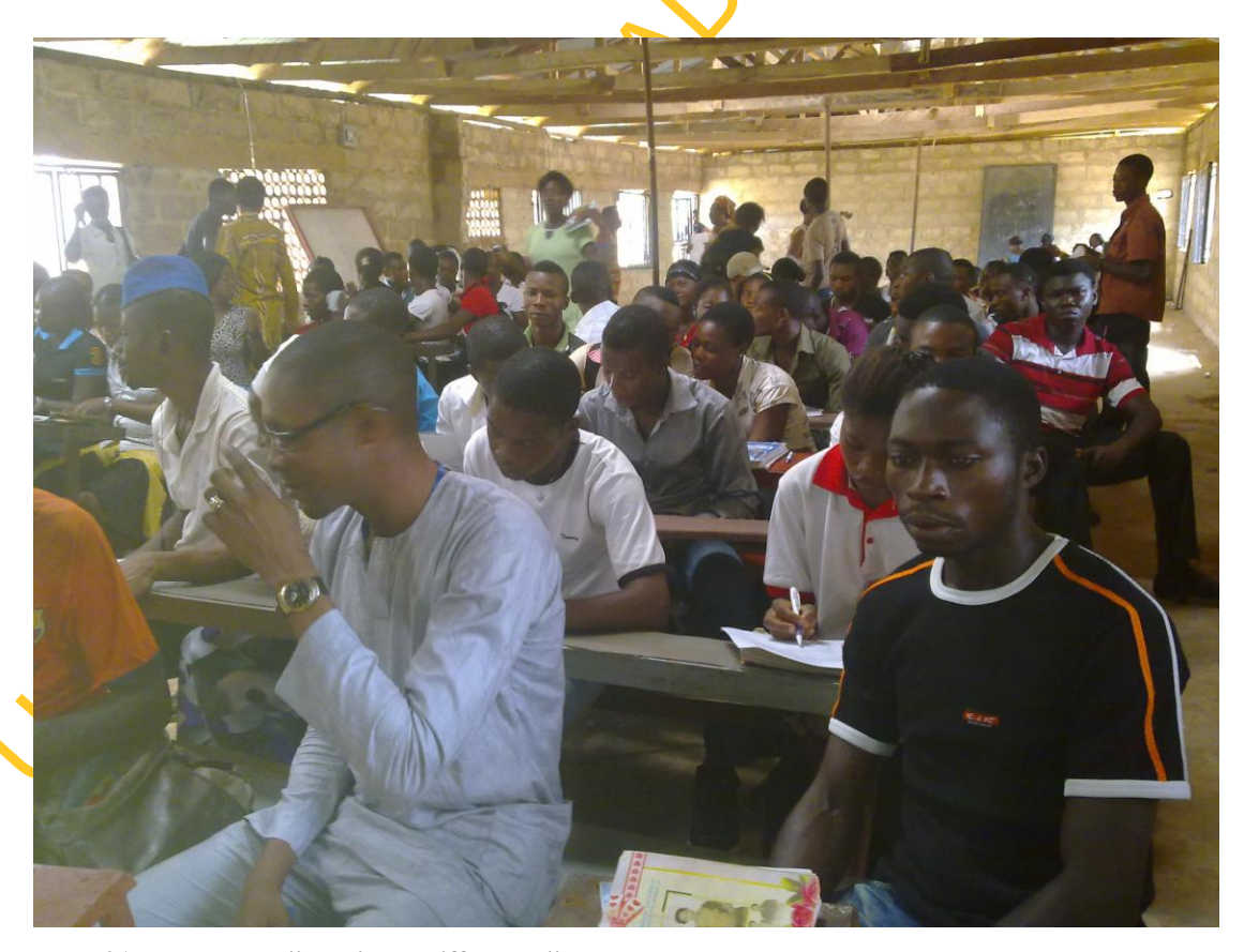
Plate 21: Lecture on "making a difference"