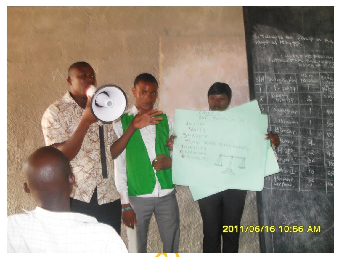
Plate 16: Presentation of posters during validation