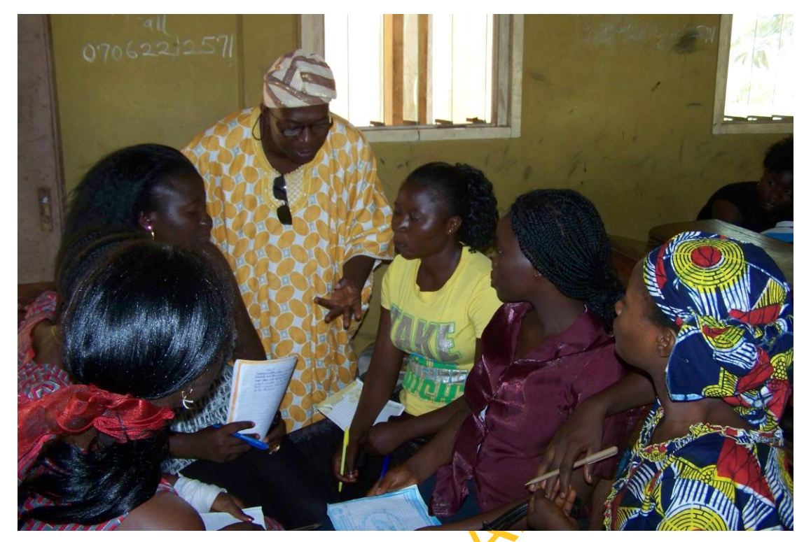
Plate 20: Focus Group Discussion Session 3