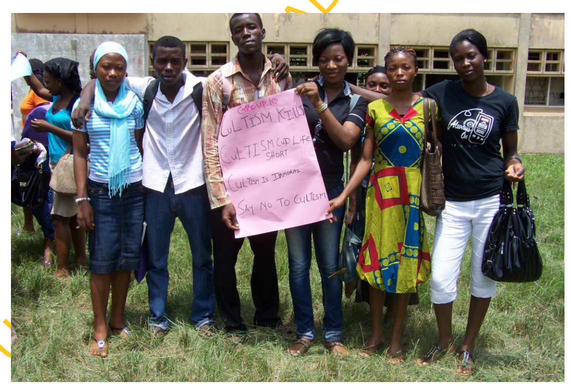
Plate 19: Group 10 presenting a poster on cultism after the workshop