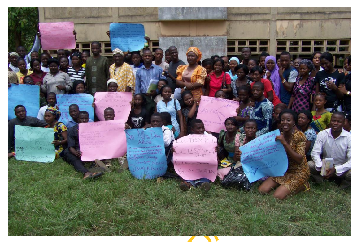
Plate 12: The resource person and all the crew members after the workshop