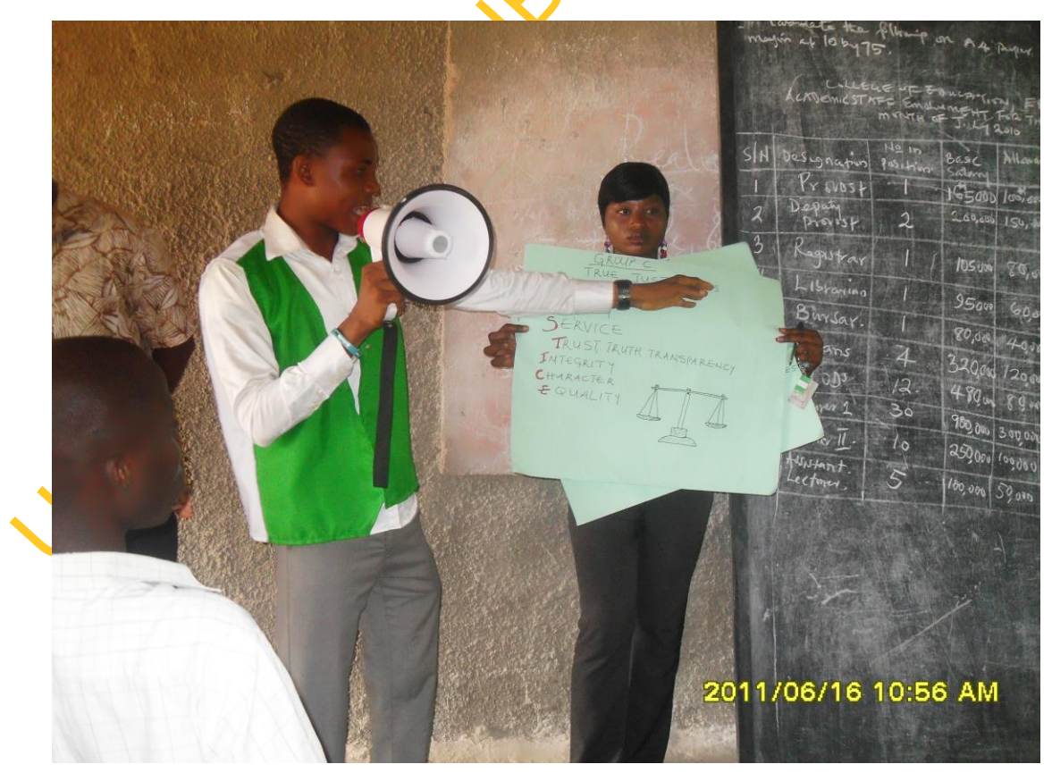
Plate 15: Presentation of posters and diagrams during the validation of the moral education programme {\bf r}