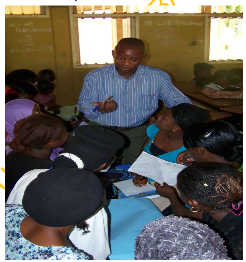
Plate 11: A research assistant during a focus group discussion guide