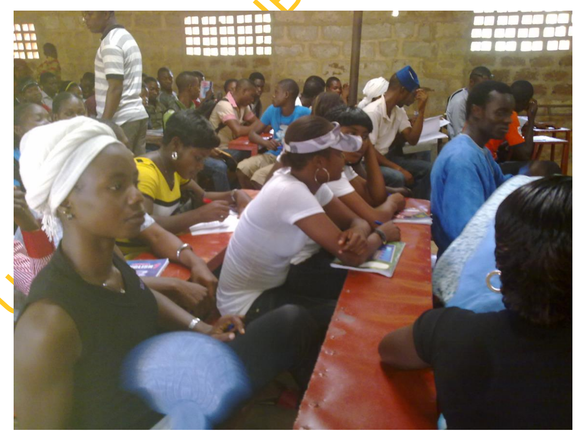
Plate 27: Modified lecture method by control group