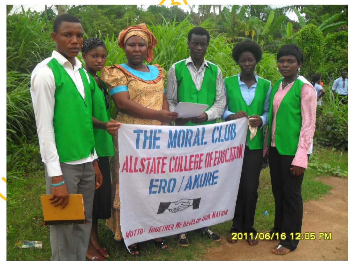
Plate 23: The researcher presenting the moral club's Constitution and Logo to the President with other members of the moral club executives