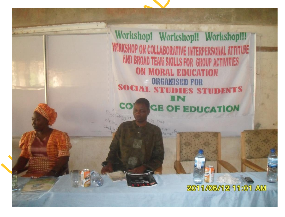
Plate 3: Researcher and Resource person before commencement of workshop