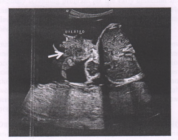
Figure 1: Transabdominal ultrasound scan showing a 20-week fetus with gastroschisis. The dilated loops of bowel are seen outside the abdomen (arrow)

A common option for women with a prenatally detected lethal or severe fetal anomaly is the interruption of the pregnancy. Such interruption, especially when done early, results in a lower perinatal mortality rate and lower health care cost because of the avoidance of long-term care that children with severe and lethal major congenital malformations need for survival. Of all the anomalies detected in this study, five were lethal and four of the mothers, that is, 80% decided to terminate the pregnancies. In a study by Chitty et al., <sup>22</sup> 93 (1.1%) congenital anomalies were detected prenatally, of which 72 (77%) were lethal and 52 (72%) of the women with lethal abnormalities