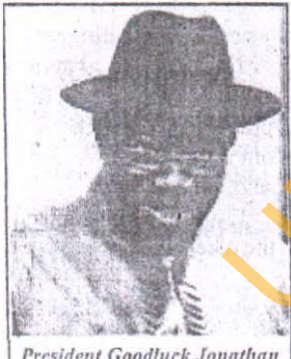
President Goodluck Jonathan

My government, while pursuing security measures, will explore all options, including readiness to accept unconditional renunciation of violence by