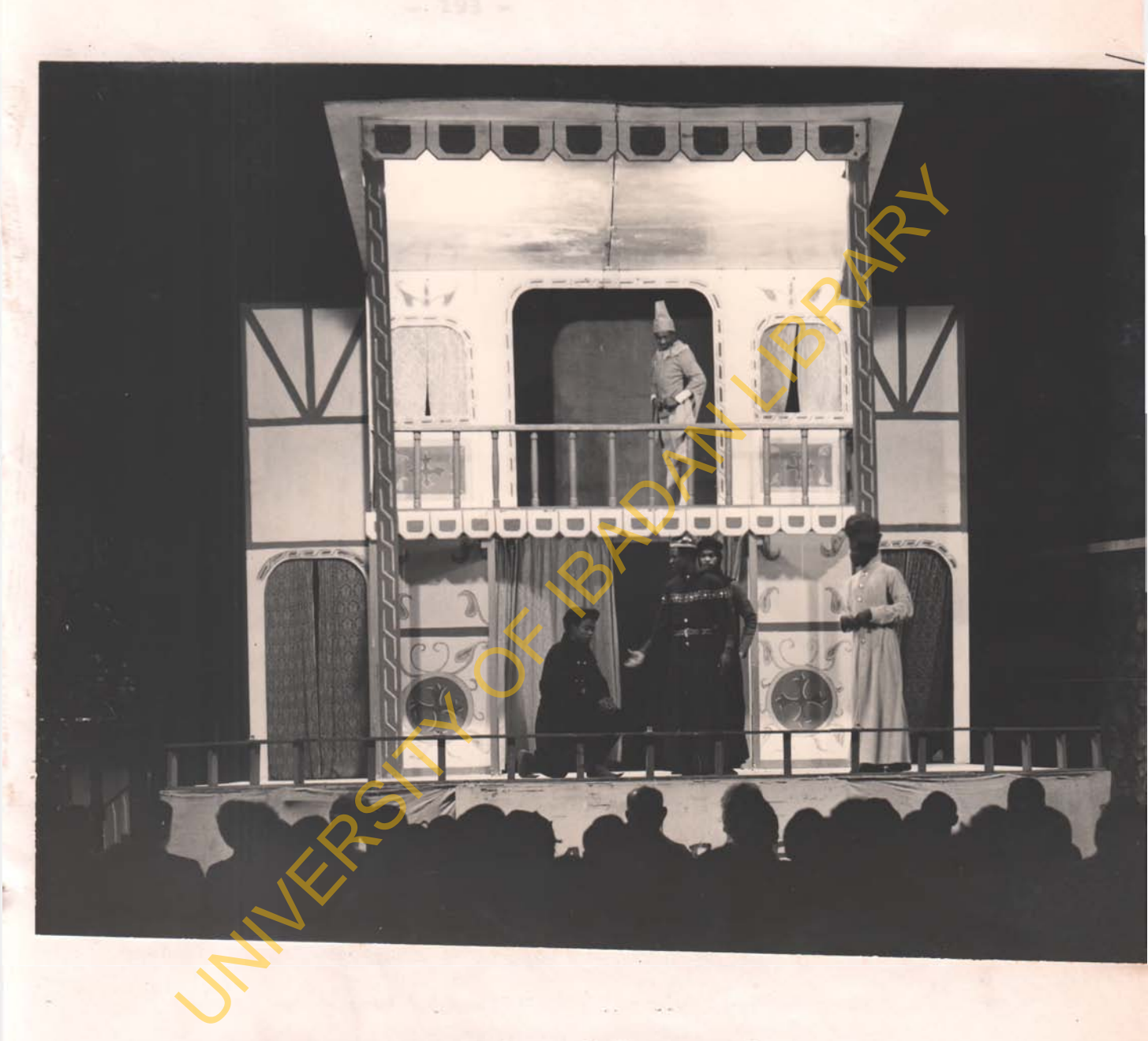
PLATE II: Scene from Shakespeare's Comedy of Errors by U.T.T., 1964