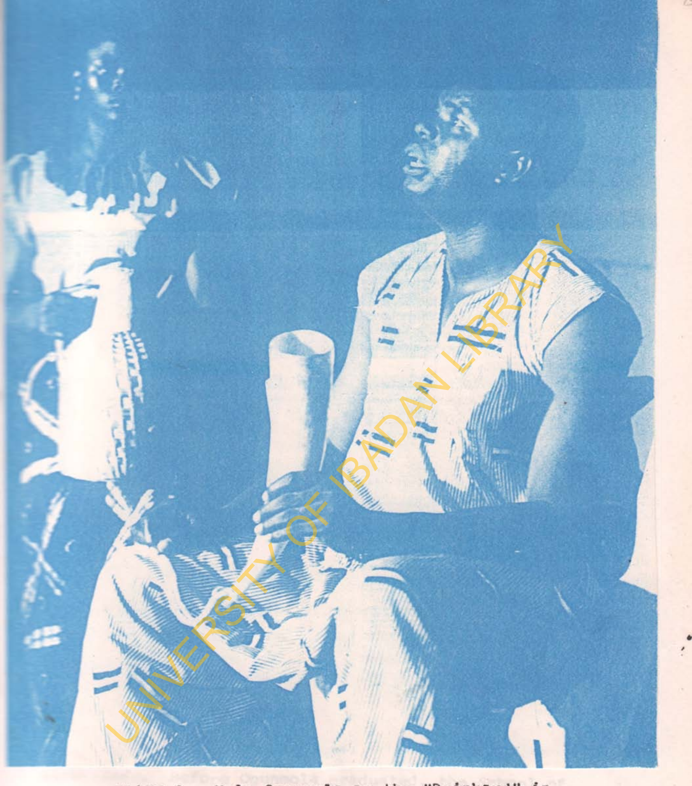
PLATE 3: Kola Ogunmola as the "Drinkard" in his eternal search for palm wine. A scene from "The Palm Wine Drinkard".