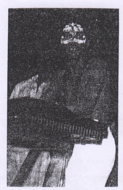
Fig. 4: Fela on stage at the African Shrine

the 'tribal' communalism of old however, his new society is a rallying point of radical pan-Africanism.