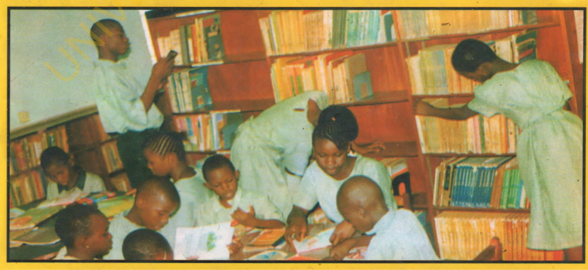
(PUBLISHED BY NIGERIAN SCHOOL LIBRARY ASSOCIATION) SPONSORED BY TERTIARY EDUCATION TRUST FUND (TETFUND)