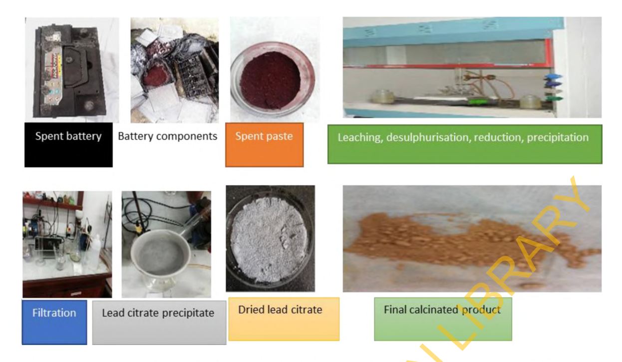
Figure 3 shows the processes for synthesis of lead precursors from waste automobile lead-acid battery for production of high purity nano-lead (II) oxide using the optimised parameters for the selected leaching, desulphurising, reducing and precipitating reagents.