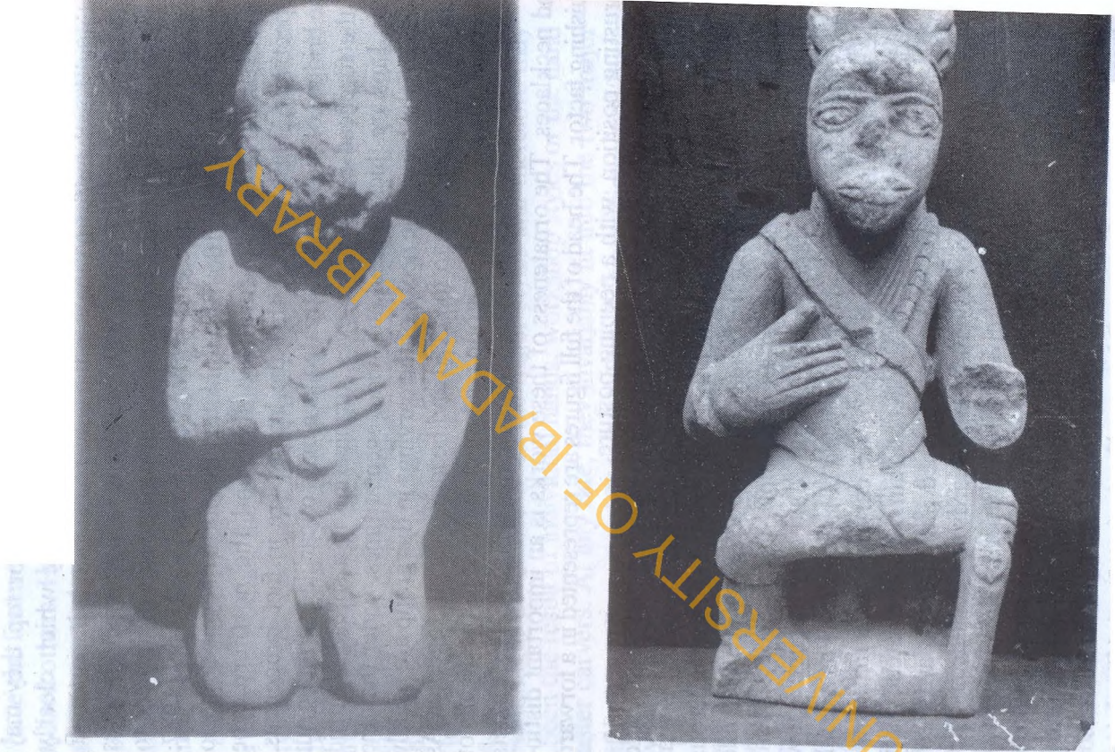
Plate 3: The figure of a kneeling naked man, Esie. It also represents the naturalistic style in Esie (National Museum, Esie)(Left). Plate 4: A stylized image from Esie. It is represented as a Warrior with a quiver on its back. (National Museum, Esie). (Right)