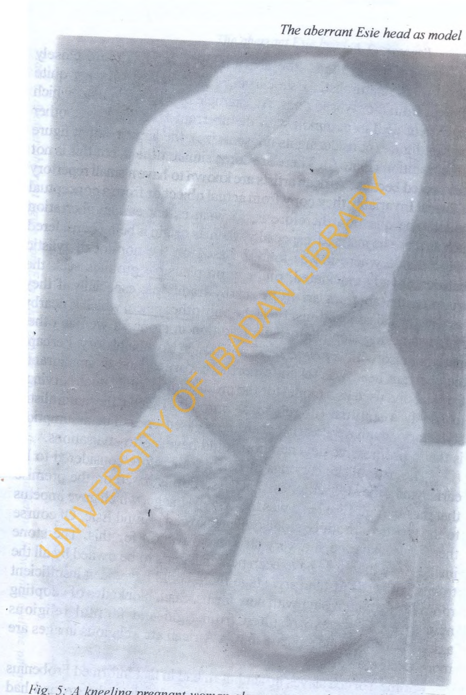
Fig. 5: A kneeling pregnant woman also represents the naturalist style in Esie (National Museum, Esie)