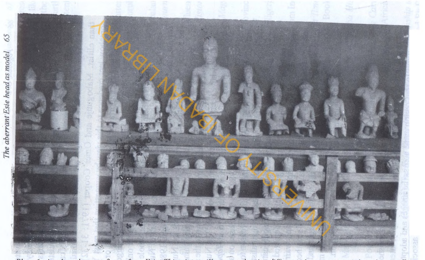
Plate 6: Another aberrant figure from Esie. This picture illustrates the size difference between it and the others in Esie (National Museum, Esie).