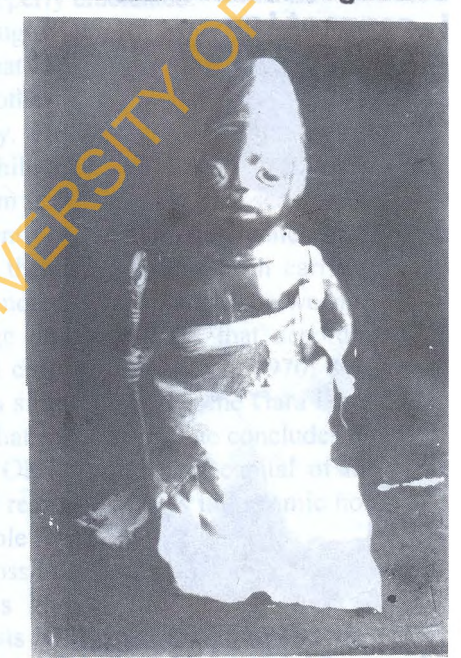
Plate 5: Little man with stick.