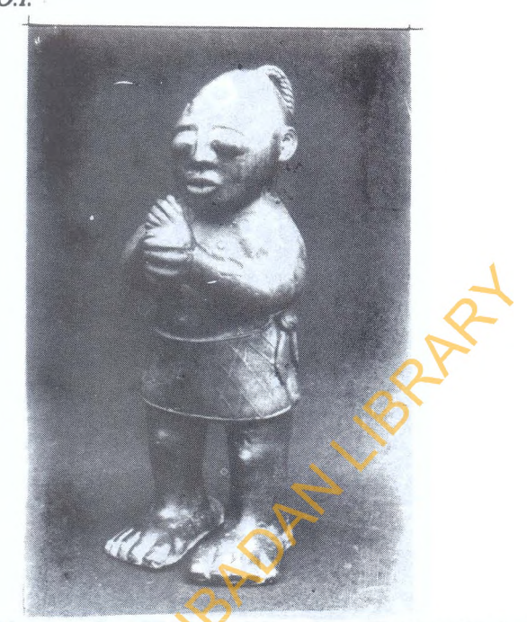
Place 6: Little man whose hand positioning suggests Ogboni connection.