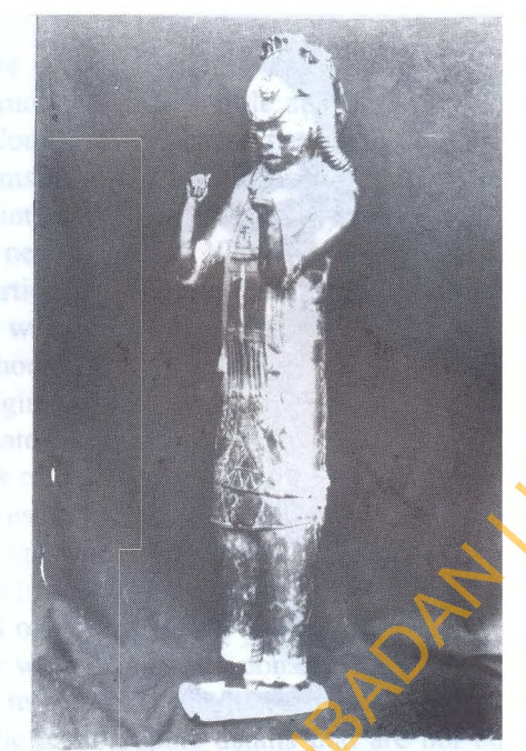
Plate 4: Gara Figure.