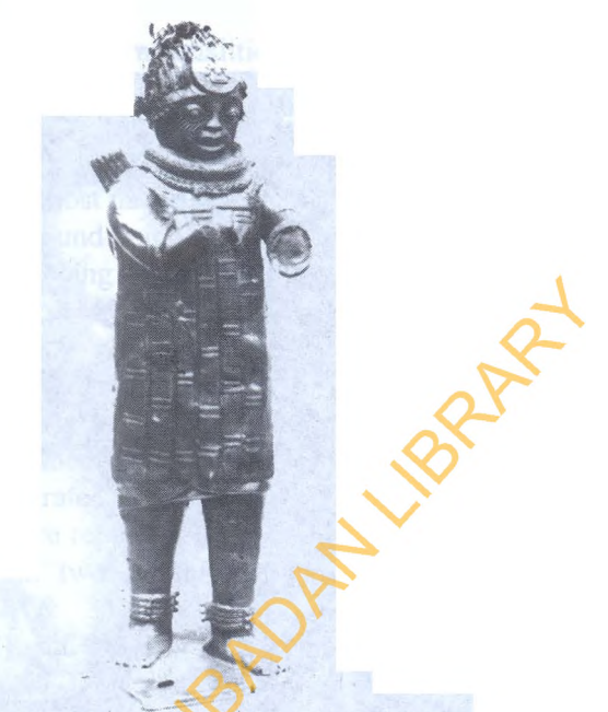
Plate 2: The Jebba Bowman.