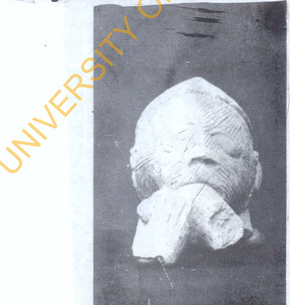
Plate 7: Esie stone figure displaying facemarkings similar to those on Jebba bowman.