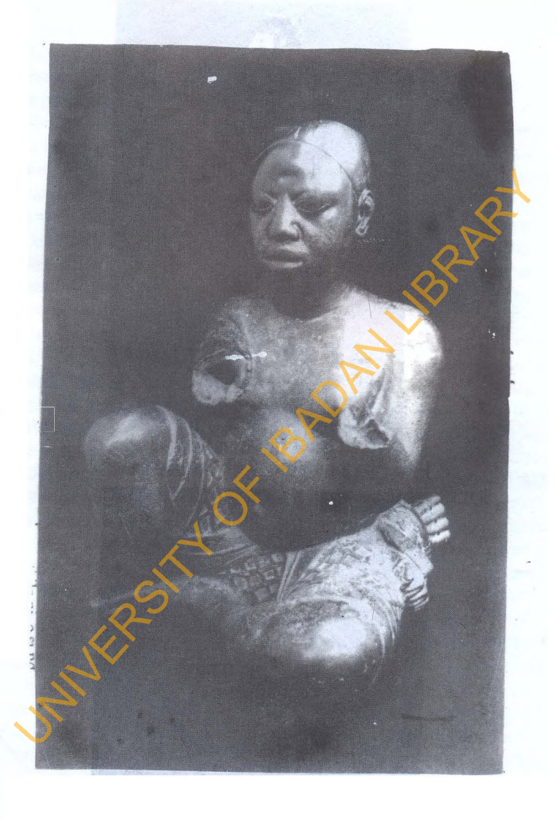
Plate 1: The seated Tada Figure.