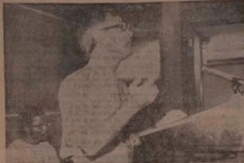
OPORON above has had the American Oghonaka Pagan... (text continues with details about the person and their background)

ARISE (March 21 - April 20) Tara was his... (text continues with astrological details for the Aries sign)