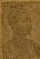
Iyafin Ransome Kuti obirin ki okunni ti fu