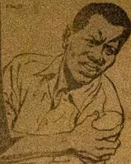
First your pain goes and then you feel better and brighter in every way after taking the world-famous remedy for arthritis.