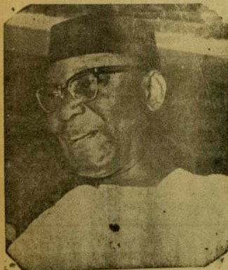
(W oro re loju ewe kerin)

E Polowo Oja Nyin Sinu IWE IROHIN ELETI-OFE