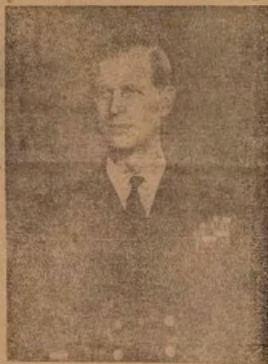
DUKE OF EDINBURGH

Nitoto ni bosibia-bosobun po fun Oba, sugbon ninu igboke-gbodo re, ko se e ni airoju kan. Bi aga awon Oyindob, bi enia ba sise pupo kan, o ni lati gba isimi, eyi yi ni idi re ti Oba na se nfe gba ategun ig si ape ona okun Mediterranean.