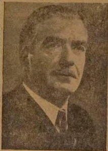
SIR ANTHONY EDEN.

Aworan Oloye nla Anthony Eden, ti ise Alakoso Ijoba ilu Oyinbo Gesi, o ti nse akowe awon ilu okere lati odun 1935 to fi di odun 1938 ni gboibo asiko rogboodian ogun ajakaye keli ni ilu o dun 1940 to fi di 1945, ati ninu odun 1951 titi to fi gba ipo Alakoso Ijoba (Prime Minister).