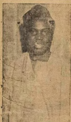
Oloye Samuel Lodeke Akintola

Adajo agba na se yi lati le ti aye sile to lati fun agbejoro Akintola ni iwe - ipejo Adegbenro ti nwon ni ki Akintola ko ri gba.