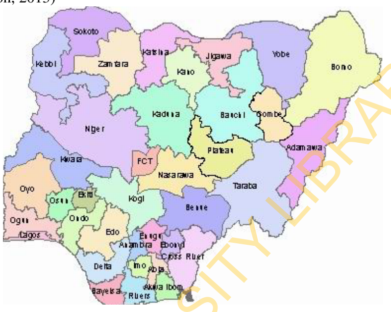
Fig. 1 Federal Republic of Nigeria

1948 with the establishment of College of Metropolitan of London in Ibadan, the ancient city in the western region now the capital of Oyo State. In 1962, the London College Ibadan became a full fledged university of Ibadan. Today, Nigeria has one hundred and twenty-eight universities, comprise 40 Federal Universities, 38 State Universities and 50 Private Universities (National University Commission, 2013)