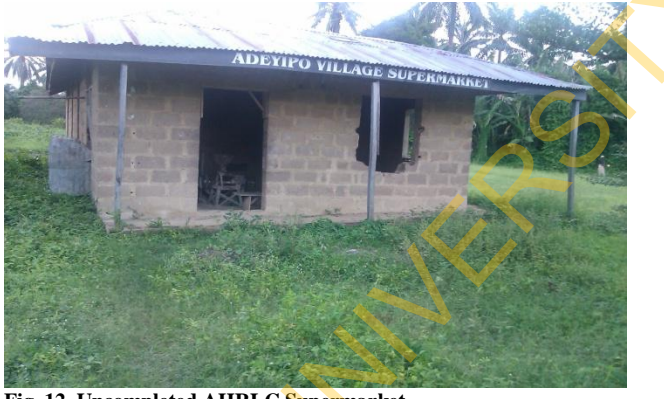
Fig. 12. Uncompleted AHRLC Supermarket

In meeting the needs of rural women and the entire community, AHRLC is faced with some challenges. One of the major challenges faced by AHRLC is lack of funds to execute their programmes. The centre depends largely on the founder and other volunteers who contribute money from time to time to meet pressing needs. There was an instance when the rural people had to contribute their widow's mite to support the centre to execute a project. Thus, there are many projects abandoned because of lack of funds, for instance AHRLC market (Fig.12). Secondly, lack of electricity is a critical challenge to AHRLC. Presently, there is no electricity and the Centre uses a generating plant and the cost of maintenance is high. The government of Oyo State had erected electricity poles in Adeyipo village for some years but up till now Adeyipo has not been connected to the grid. This handicaps the Centre to use the available information and communication technologies, such as computer system, television and others as often as they would have wanted. Other challenges highlighted during the interview were lack of trained librarians because the centre could not afford to employ and lack of motorable road.