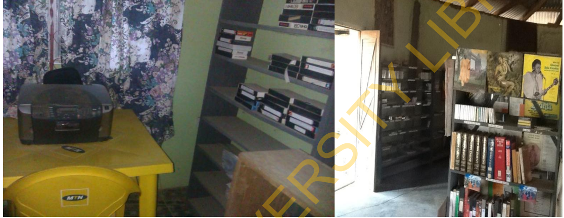
Fig.6: Audio Visual section at AHRLC

iv Audio Visual Service. There is an audio visual section where rural women also listen to educational audio cassettes translated to their local language