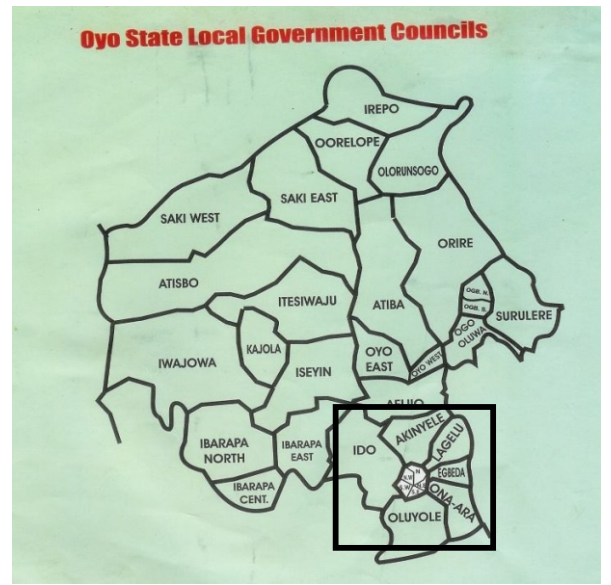
Figure 1 : Map showing 32 local government areas in Oyo state, with six of them in the suburbs of Ibadan city, shown within the box. Ibadan city is the central circle within the box.