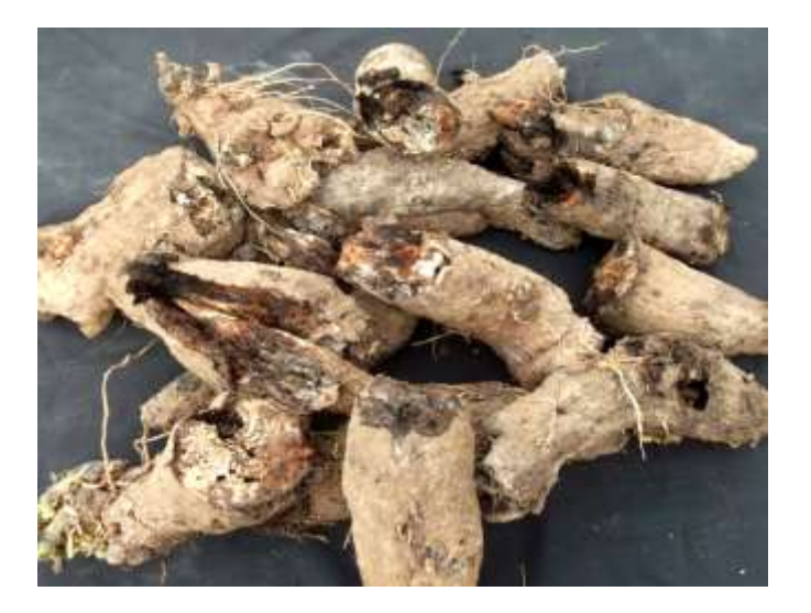
Plate 1. Dioscorea cayenensis tubers attacked by fungal rot disease under natural infection.

in West Africa and serves as an important source of income to the people. Postharvest deterioration of yams has been attributed to insects, nematodes, respiration of the dormant tuber, sprouting, and microbial attack (Ikotun, 1989; Okigbo, 2005). Microbial rot accounts for the highest losses in yam tubers during storage, with fungi being responsible for greater loss than any other single cause (Amusa et al., 2003). The major fungal pathogens associated with storage rot of yams include Penicillium Lasiodiplodia theobromae, oxalicum. Aspergillus niger, Rhizoctonia solani, Sclerotium rolfsii, and Fusarium oxysporum (Green et al., 1995; Dania, 2012).