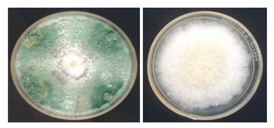
Treatment A Treatment B (Control)

TL = Trichoderma longibrachiatum; TA = Trichoderma asperellum.