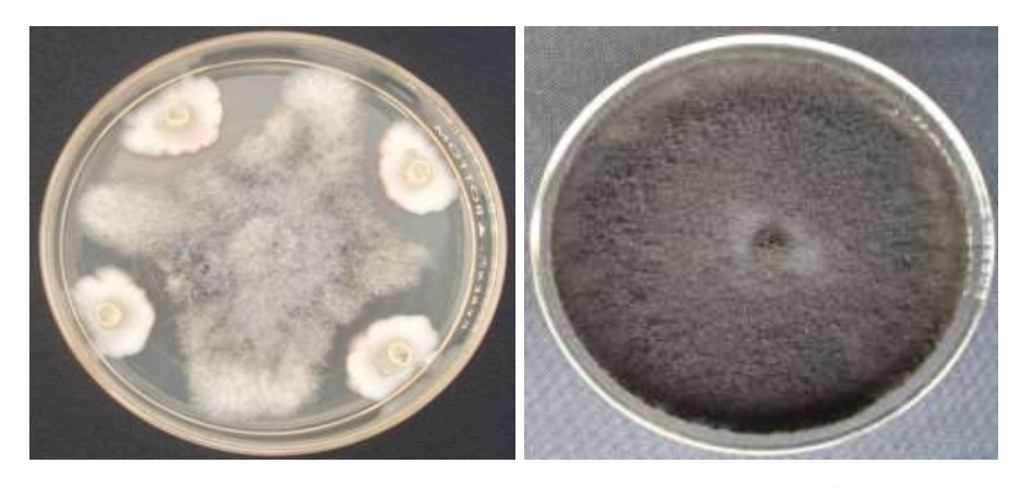
Treatment A Treatment B (Control) Plate 2. Inhibiting effect of P. fluorescens on L. theobromae

Means with the same letter along the column are not significantly different (P=0.05) using the least significant difference (LSD)