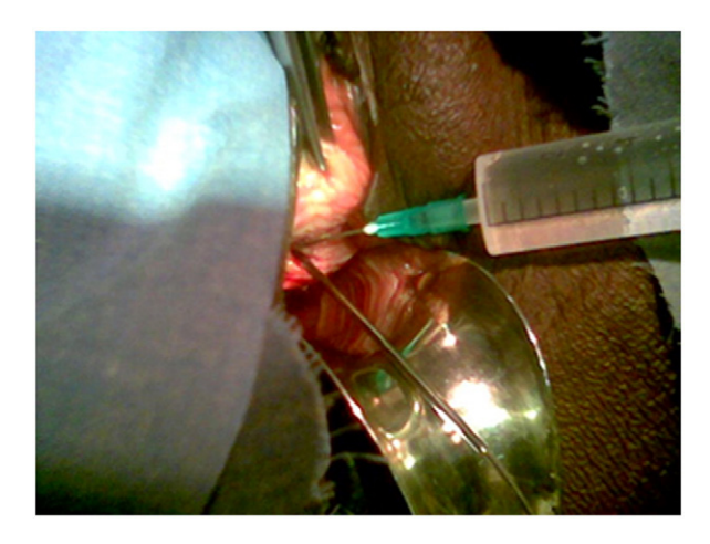
Figure 1 A probe is inserted through the fistula and the area is infiltrated with a 1% lidocaine solution before repair.

In many developing countries, the repair of vaginal lacerations, including episiotomies, is performed using a local anesthetic agent. Local anesthesia has also been used to perform such major procedures as laparoscopy or cesarean deliveries [11-13]. The agent commonly used is lidocaine hydrochloride, with or without epinephrine [11–13], with results reportedly similar to those of general anesthesia, especially when an opioid analgesic/sedative is concurrently administered [12]. Infiltrative anesthesia is easy to administer and adverse reactions are negligible, making its use practicable in settings without an anesthetist. The content of a bottle of lidocaine can be distributed among at least 3 patients undergoing fistula repair, making the cost per patient negligible. There is therefore a need to explore this approach in Nigeria as part of the effort to provide fistula repair to all the women who need the service, irrespective of their place of residence or socio-economic status.