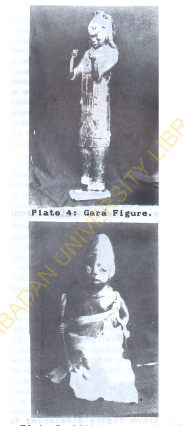
Plate 5: Little man with stick.