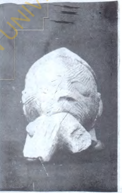
Plate 7: Esie stone figure displaying facemarkings similar to those on Jebba bowman.