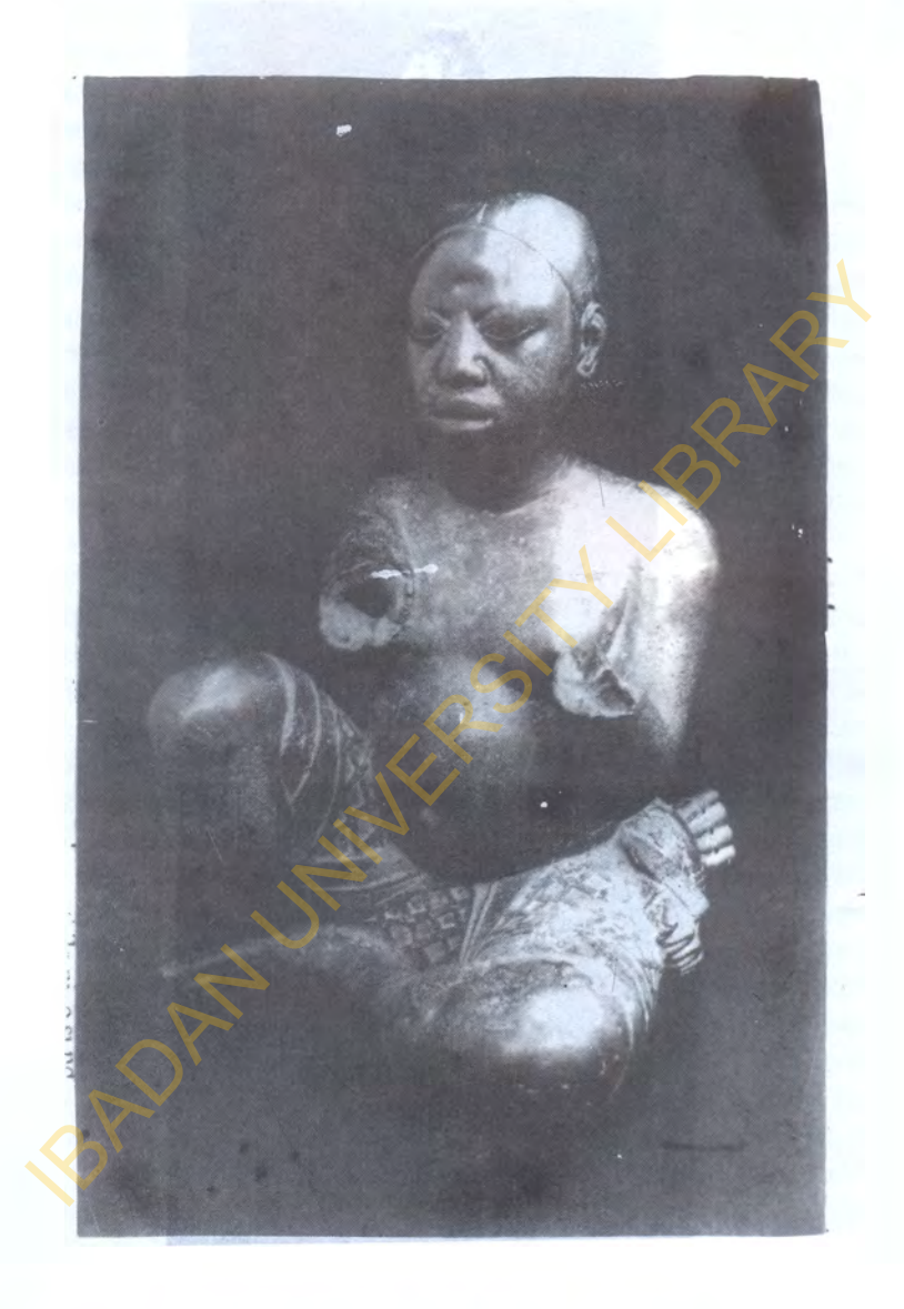
Plate 1: The seated Tada Figure.