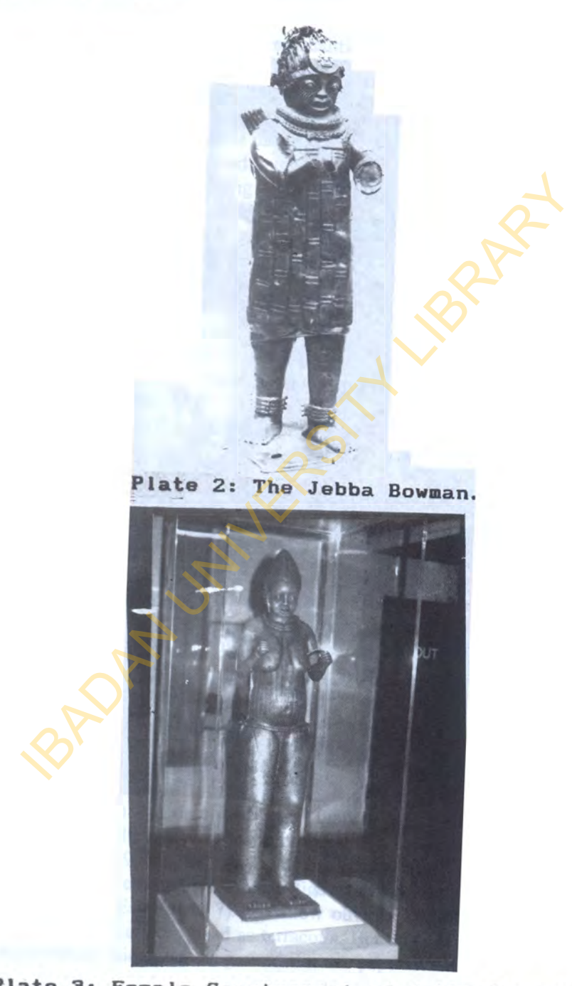
Plate 3: Female Counterpart of Jebba Bowman.