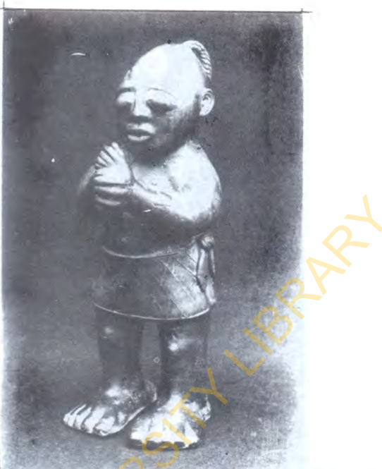
Plate 6: Little man whose hand positioning suggests Ogboni connection.