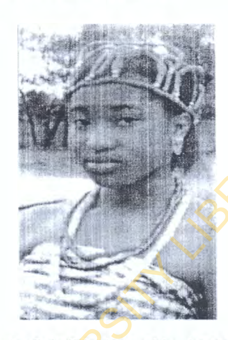
Plate 5: An Ovia (Maiden), with a beaded crown