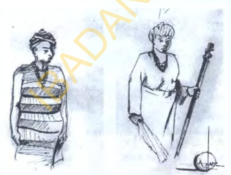
Plate 3: 21<sup>st</sup> Century Ovia Plate 4: Iyaodina in Full regalia (Maiden) (An artist's impression) (An artist's impression)