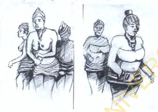
Plate 1: Indigenous Ivia (Maidens) Plate 2: Ivia (Maidens) of the late 20<sup>th</sup> (An artist's impression) Century (An artist's impression)

As a stabilizing, unifying factor, Ovia-Osese remains the only traditional mechanism to guide, guard and give a sense of morality and chastity based on observable purity. In a rapidly decadent society, Ovia-Osese , in no mean dimension, tries to reverse, revamp and restore good and enduring public morality and conduct. The purpose, functions, aims and objectives of Ovia-Osese are noble, invigorating and progressive, as it upholds the cultural values of Ogoriland. Since Ovia-Osese is dynamic, it is therefore susceptible to the contending contemporary external stimuli. Consequently, a lot of innovations have greatly influenced Ovia-Osese festival. Thus, the festival has been reduced drastically to mere entertainment with seemingly uncontrollable, unchecked chastity and morality among Ivia (maidens).