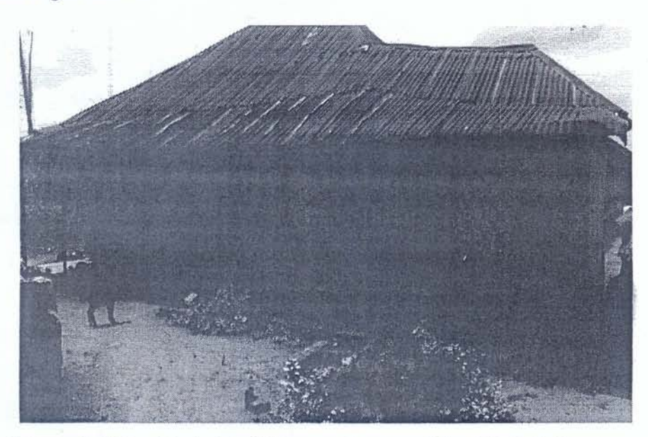
Figure 2: Dilapidated building used as ward for TOP Patients

The perceived benevolent posture of practitioners was also observed to have reflected in their attitude and ways of relating with patients. Practitioners often cracked jokes with patients and sometimes relaxed with them in the evenings. This contributed to the restoration of patients' health which according to WHO is not merely the absence of disease or infirmities. Although practitioners could not afford to build wards for patients as obtained in western hospital settings, they offered them free accommodation to all in-patients even if it meant begging members of their community to accommodate patients as a humanitarian gesture. However, such accommodation was mostly located in dilapidated or uncompleted buildings such as presented in Fig-2 and Fig-3 below.