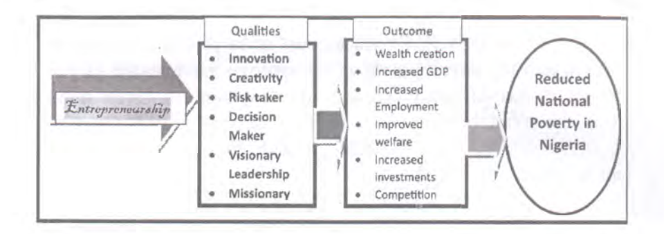
Figure 1: A conceptual view of Entrepreneurship

From the figure above, reduction of national poverty as currently entails in Nigeria lies in entrepreneurship. The issue is how do we develop the above qualities in our graduates which the system churns out every year to a minimum of 400,000. Except we delude we deride in deluding ourselves, the government and the organized private sector cannot employ these people indicating we have to look somewhere and in the opinion of this paper, this somewhere referred to could be entrepreneurship. How do we get there?