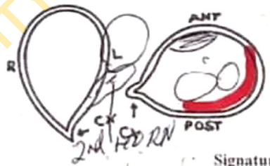
Figure 1. Sonologist impression of the uterine didelphys with pregnancy in the right horn.

Review at the antenatal clinic at 37 weeks revealed fetal cephalic presentation at clinical examination. However, at 38 weeks and four days of gestation she presented in labour and obstetrics examination revealed a singleton fetus in longitudinal lie with footling breech presentation. She subsequently had emergency lower segment Caesarean section and was delivered of a live neonate with a birth weight of 3.75 kg via breech extraction from the right horn, the left horn was bulky and equivalent to about 14 weeks size gestation (Figure 2). Each horn had its adjoining normal looking fallopian tube and ovary. The urinary bladder was grossly normal. Her postoperative period was satisfactory and she was discharged on fourth day after surgery.