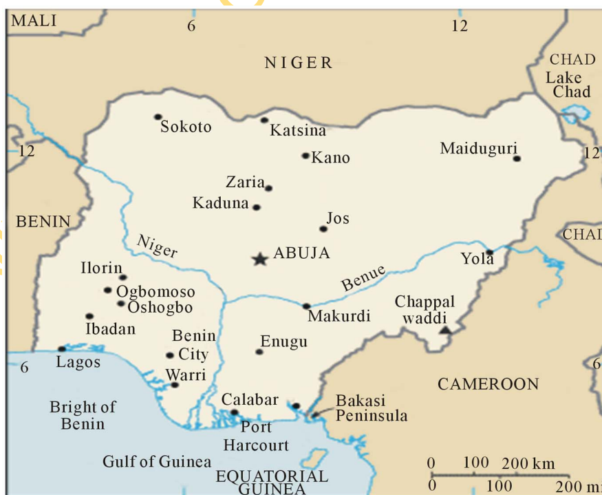
Figure 1. Map of Nigeria showing the location of Calabar, the study area.

The data collected were analysed using the Statistical Package for the Social Sciences (SPSS 16.0) software to generate the means and percentages of the values. By the application of inferential statistics (Chi-Square test), the