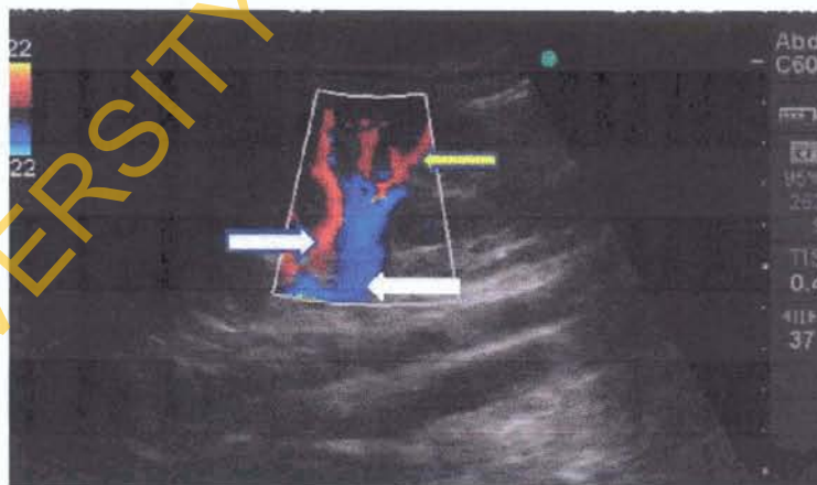
Fig. 1. Colour Doppler sonography of the main renal and segmental vessels White arrows = main renal artery (red colour) and vein (blue colour) and the yellow arrow = segmental artery

Participation in the study was completely voluntary and based on written informed consent from parents/ care givers and assent of the children. Participants were made to understand that they are free to withdraw their consent at any time and that they will receive standard level of care. Privacy of participants was censured by using a serial number on the information collected, rather than a name or school register numbers. The study protocol was reviewed and approval for the study was obtained from the University of Ibadan/University College Hospital Ethical Review Committee.