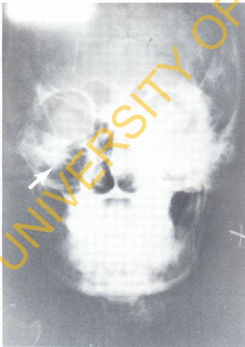
Fig. 4. X-ray picture of a cap in the orbit.

focus on animals with the right eye while trying to shoot, while the left eye is kept closed for a no-parallax view between the gun and animal. In the contusion groups 71.5% of the patients were shot at, all by armed robbers. In this group, the cause of the contusion may be due to the fact that the gun being fired was at a distance from the patient, unlike the patients who were shooting, in whom the backfiring gun was right next to their faces.