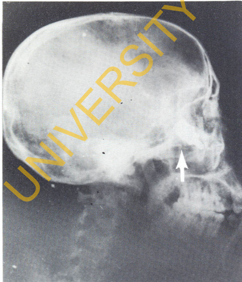
Fig. 1. X-ray picture of a cap in the zygomatic region.

Of the 16 eyes with perforating injuries, seven had retained intra-ocular foreign bodies, four had the pellets in their orbits, one had the pellet embedded under conjunctiva and one had the cap of the pellets embedded in the zygomatic region of the face (Fig. 1). In three eyes, the pellets were nowhere to be found. X-ray pictures of some of these patients showed different sites of the pellets (Figs 1-4). Four of the 16 perforated eyes had total rupture of the globe with loss of intra-ocular contents, and the evisceration was thus completed surgically. All four eyes were hit by the cap of the pellet compartment of the gun which shot back into their eyes as they were shooting. The size of these caps ranged from 20 to 30 mm in length. Eight of the 16 perforated eyes had evisceration as the primary surgical procedure, two refused evisceration, the eyes eventually becoming phthisical, and six had repair of corneal and/or scleral wounds, with removal of retained intra-ocular foreign bodies. Foreign bodies in the