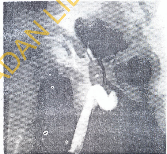
Fig. 1: Radiograph of a pre-operative retrograde urethrogram done 3 days after presentation in a patient who was admitted with acute urinary retention and blood at the meatus following a road traffic accident. The study shows abrupt cessation of contrast flow in a posterior urethra with intravasation of the contrast into the pelvic vessels in keeping with a traumatic posterior urethral disruption. Note bilateral fractures of the superior and inferior pubic rami

A 28 year-old male presented to our Hospital with a suspected pelvic fracture following a pedestrian road traffic accident (RTA). He was unable to urinate necessitating an emergency suprapubic cystostomy to relieve his retention. His prostate was normally placed on rectal examination. Plain x-ray of the pelvis confirmed moderately displaced bilateral fractures of the superior and inferior pubic rami with symphyseal diastasis. Subsequent retrograde urethrogram showed complete urethral disruption of the prostatico-membranous urethra with extravasation of contrast (Fig.1).