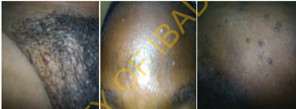
Figure 1: Genital Molluscum contagiosum Lesion