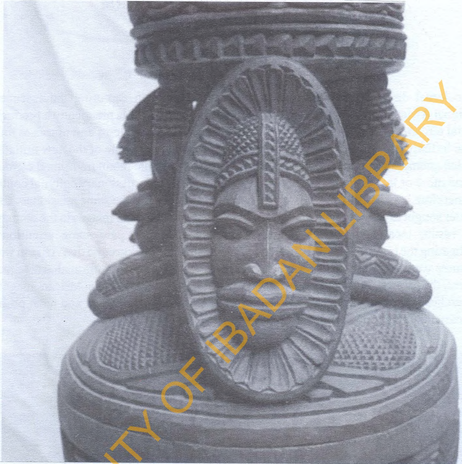
Detail of a work

Art circles in early 19 th century Europe, especially around Paris, benefitted tremendously from experiencing African art when it instigated and catalysed a new art there. Avant-garde artists of the time had tacitly given credence and recognition to African art by adopting the freedom of expression they learned from the authors of the African wood sculptures, then referred to as curiosities, that they had purchased to decorate their studios. Having played such an overwhelming catalytic role, it left little doubt that African arts had to be investigated further. A number of anthropologists/ethnographers and others in the discipline of understanding man in his totality then began to actively investigate the objects and their makers. This again gave impetus to the study of African art as an academic discipline which today has earned worldwide recognition having since evolved its own modus operandi and specific methodology.