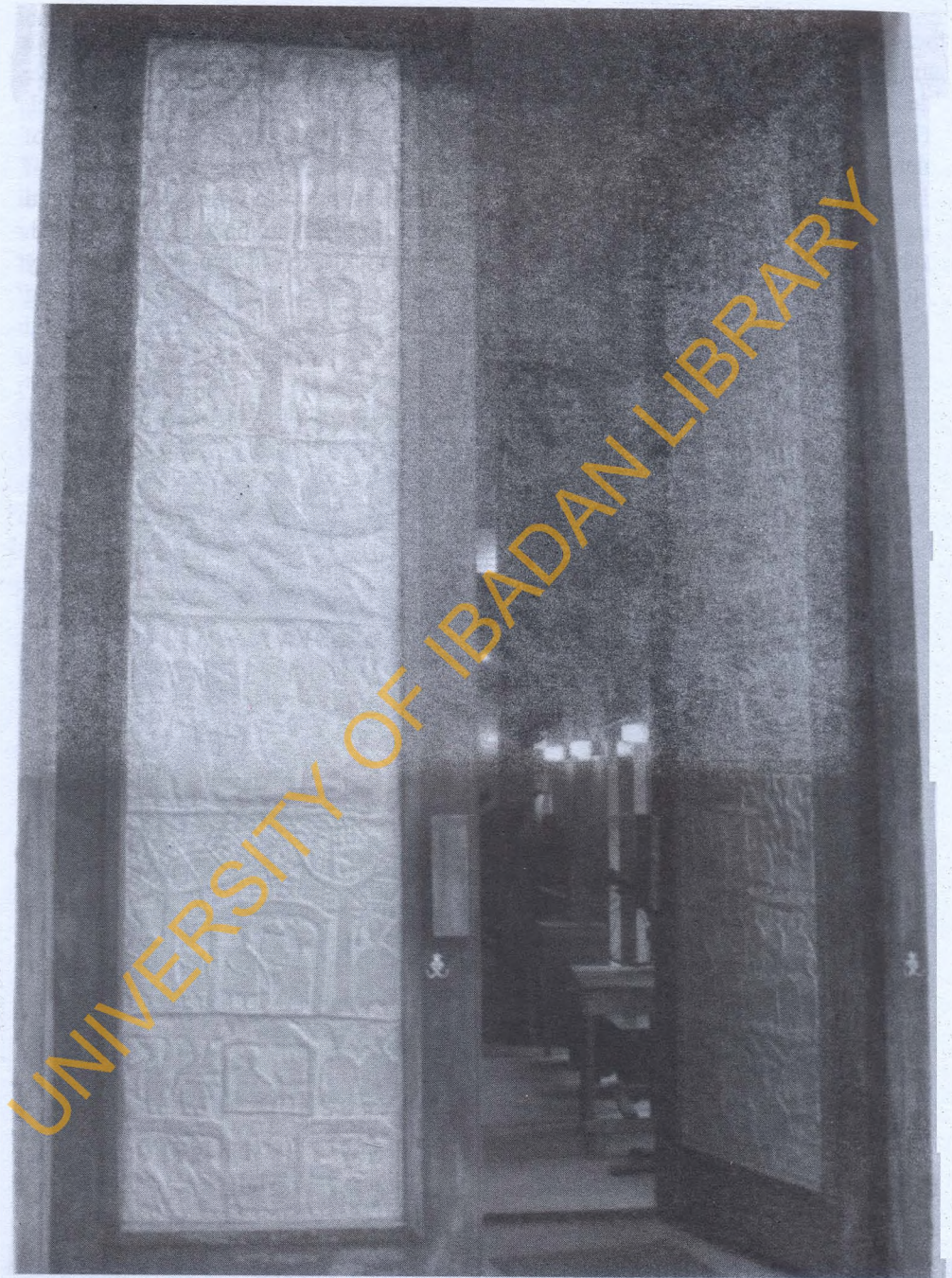
Metal panels: U.I. Seat of Wisdom