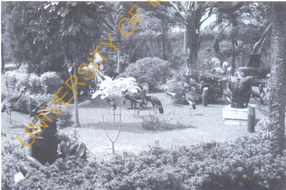
Works in OYASAF garden

Post colonial discussions of African art initially centred on capturing the essence of traditional African arts alongside a new contemporary art that was practically a product of colonial circumstances. Growing side by side these were to all intents and purposes, other artistic initiatives fashioned after western cultural parameters. Some of the new initiatives included attempts to study, understand and as much as possible retain traditional elements that had more or less been deliberately relegated as a result of missionary colonial contact. And therefore here lies the huge historical contradiction, for it is the same missionary force that later sought to encourage, foster and allow the use of traditional images in the churches. As a result, local and outside initiatives around that time paid some attention to investigating the traditional arts. In doing this and against the background that African wood sculptures were incontrovertibly the best and most widespread of traditional arts to reach the west, the efforts of the Catholic mission to encourage and propagate African images in its churches led to the inadvertent discovery of one of Africa's greatest and most prolific woodcarvers, in Nigeria, Lamidi Fakeye.