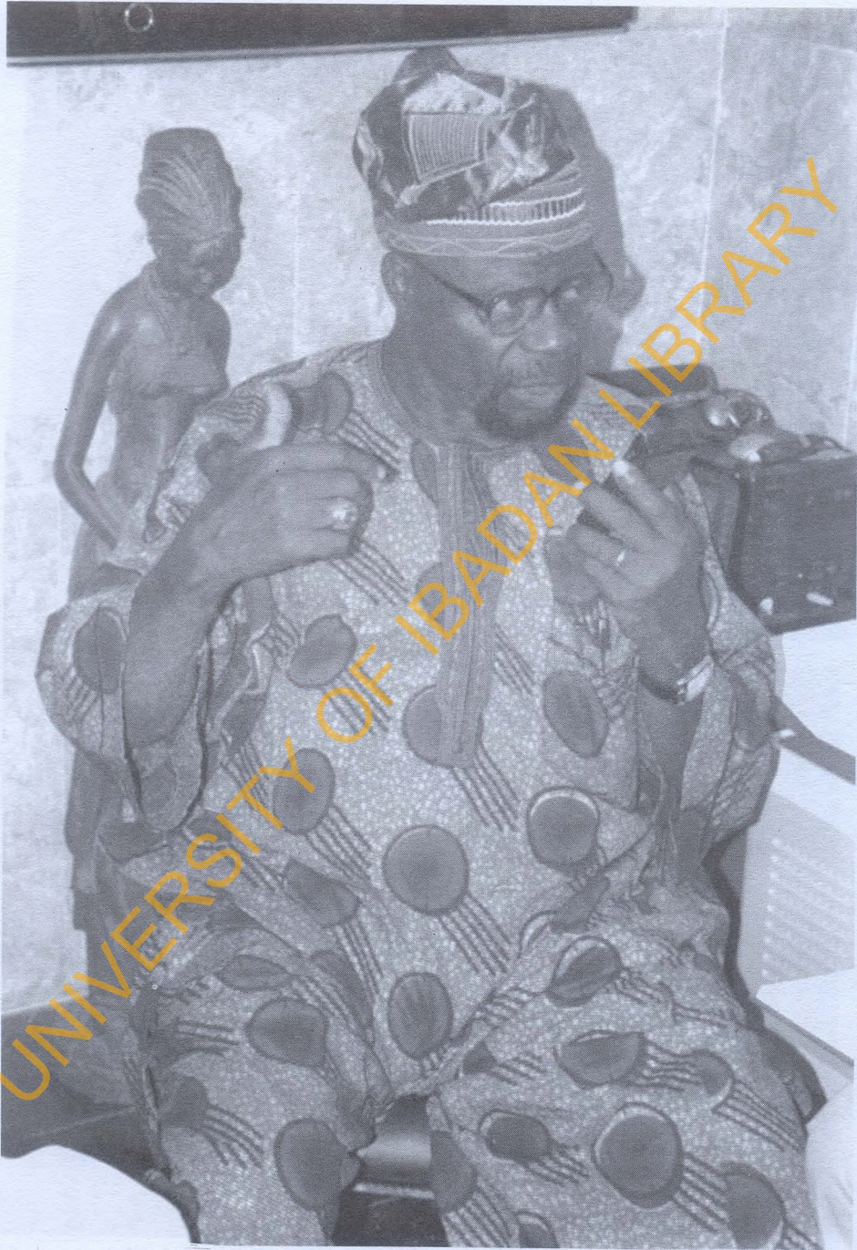
Granting an interview