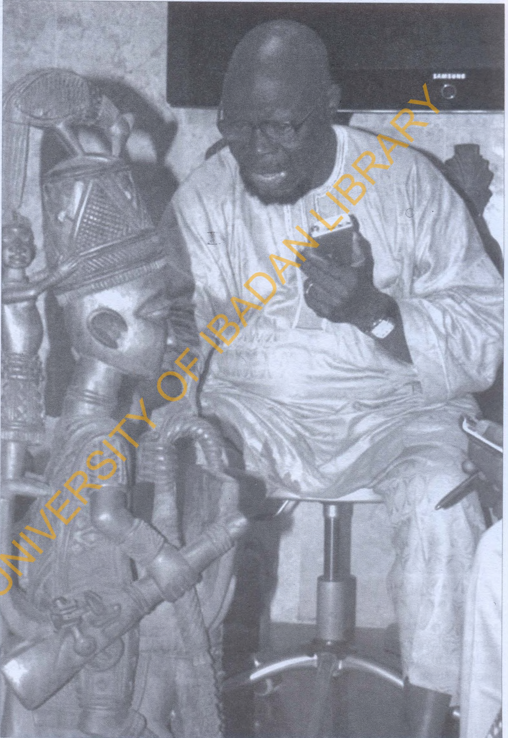
Addressing one of his creations?