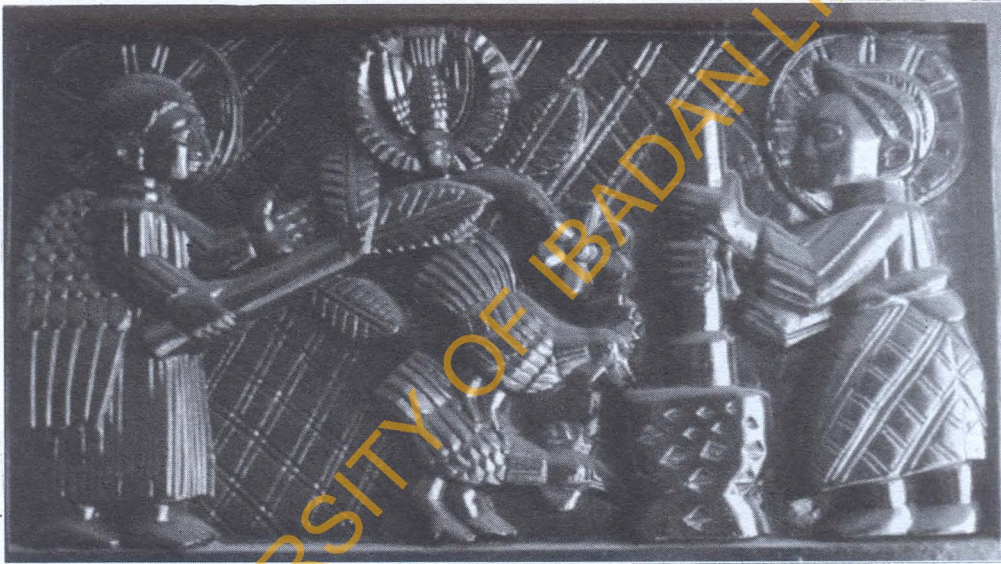
Annunciation: U.I. Lady Seat of Wisdom