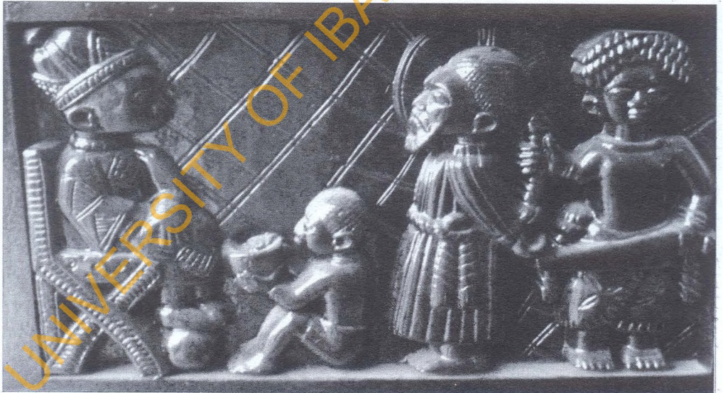
Jesus before Pilate: U.I. Seat of Wisdom