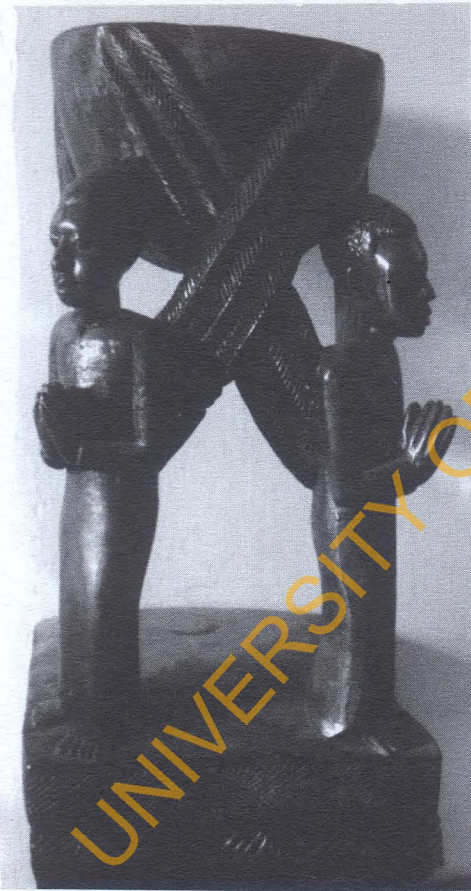
Holy water font: U.I. Seat of Wisdom

Timber's Titan: An exhibition of Wood Sculptures by Lamidi Fakeye . Mydrim Gallery, May/June 2008