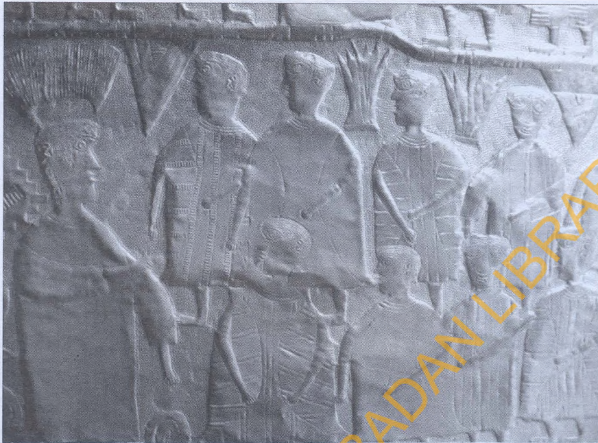
Metal panel detail: U.I. Seat of Wisdom