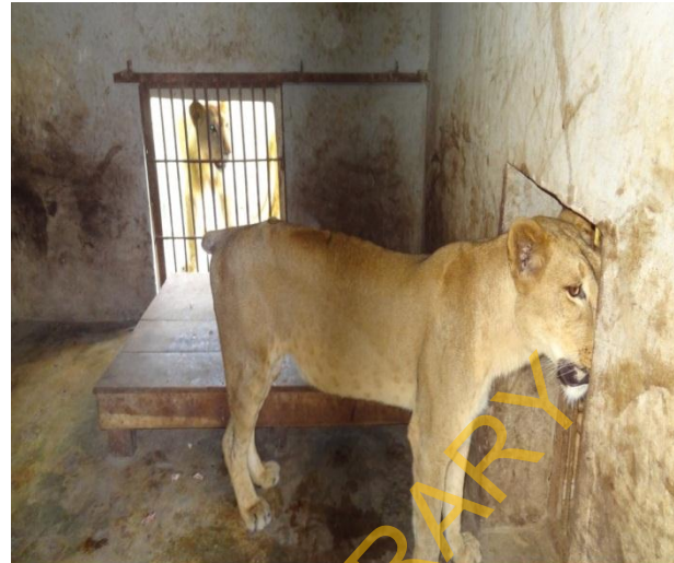
Plate III: Lioness post operation.

Africa (Packer et al. , 2013). Their threat in the wild have been associated with indiscriminate killing (to protect human life and livestock) and prey base depletion, habitat loss due to human activities (Bauer et al. , 2015), and poaching leading to suggestion of fencing of conservation areas (Packer et al. , 2011, Packer et al. , 2013).