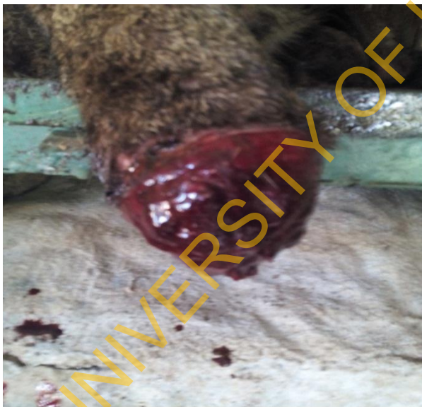
Plate I: Lioness tail showing wound before surgery

The animal was brought out of the restraint cage into a clean compartment earlier prepared for animal comfort and to prevent possibility of injury that may result from recovery episode with the restraint cage. Cephalexin, 10mg/kg every 12 hours (Dowling, 2010), incorporated in food bit was administered for five days post surgery. The tail wound was also covered with honey as earlier described (Eyarefe & Oguntayo, 2012, Eyarefe et al. , 2012). The wound healed uneventfully and sutures were removed three weeks later when the lioness could be lured into the restraint cage under chemical restraint with xylazine–ketamine combination.