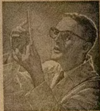
Sodium N. Lauroyl Sarcosinate SAME RAVILJAR, PACKAGE

Awon Alase isegun chin ti se asowo re fun odun kan pe egbogbi na ko nkuro beni ki asa. Bi o ba sa ti nlo ni ojojumo, laro ati ni ale, ko ni jeki chin baje tosan t'oru.