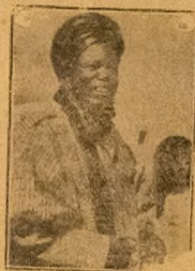
Sadauna Of Sokoto