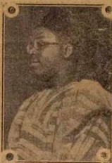
Oloye Obafemi Awolowo

Ki Edunare Oba Oga Ogo so won fun wa lohun, ki o si pa ona mo fun abo won ni alafia. Amin aye, beni ki o ri.