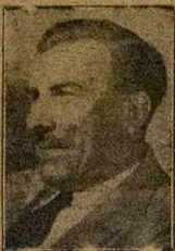
SIR JAMES ROBERTSON

Ni ojo kokanla osu July, ni Qlola Gomina Agba yio fo lo si Maiduguri lati Sokoto, lati ibe lo si Jos lehin ojo mejji.