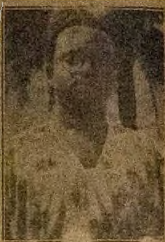
OLOYE ANTHONY ENAHORO