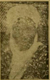
rice wo nizu oju July

o o o o o Iwesa o jide ni lu E o ni o s' y ipe O t i i bi Apapose ti fu Nipari yo be ile Ame-