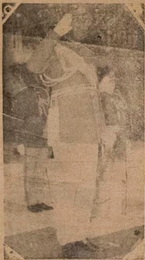
DR. NNAMDI AZIKIWE (Baa'e Apapo ilu Nigeria)

On leaving London they will tour Wales and south west England and later travel to Scotland for sightseeing and to meet teachers and voluntary workers from women's organisations. The four ladies will return to Nigeria on 11th December.