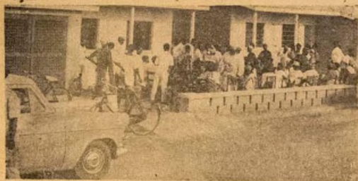
VICTORIA ISLAND NEW-DOUBLE CARRIAGEWAY RD UNDER CONSTRUCTION

Prices will be the same, except for some larger storey houses suitable for persons in the higher income groups which will be sold for £4,500/15,000.